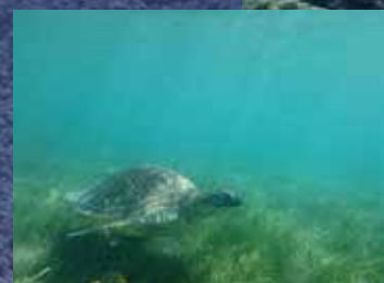
Subtidal seagrass meadows at Green Island