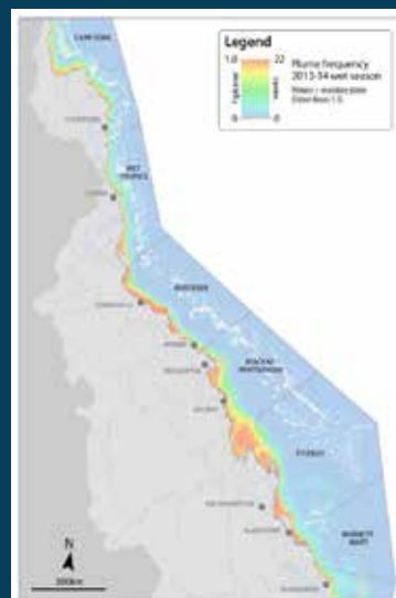
Mean frequency of river plume waters (colour classes 1-5) in the Great Barrier Reef for the 2013-2014 wet season. River plume frequency maps illustrate the movement of riverine waters, but do not provide information on the composition of the water and its constituents. The river plume frequency is calculated as the number of weeks within a wet season (22 weeks across Dec-April) that a given area was exposed to river plume waters.