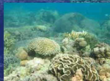
Inshore coral reef

The majority of inshore seagrass meadows across the Reef showed evidence of recovery from previous disturbances, with the greatest improvement in abundance in the Burdekin region. Seed banks and reproductive effort also improved at coastal and estuarine sites; however, they remained poor at subtidal reef sites suggesting low capacity to recover from additional disturbances. The rate of dugong and turtle strandings has reduced back to levels prior to its peak in 2010/2011, however there was an increase in turtle strandings in the Rockhampton region.