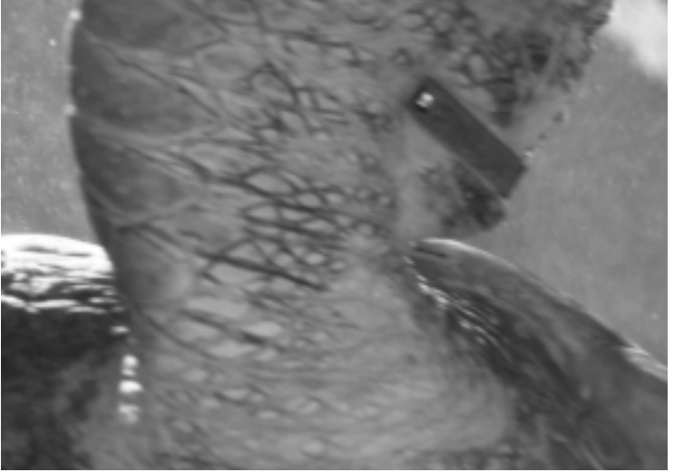
A turtle with a tag attached to its flipper

Individual turtles are tagged using numbered titanium tags. These tags are self-piercing, selflocking and are applied to the rear edge of either or both front flippers, using specifically designed tag applicators.