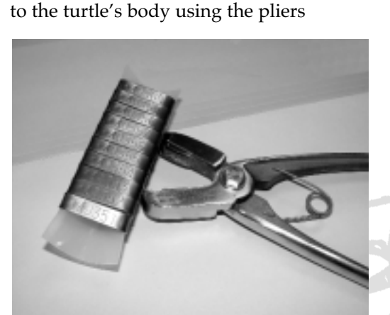
Titanium tags and specially designed pliers

Tags are attached through the scale closest to the turtle's had using the plices