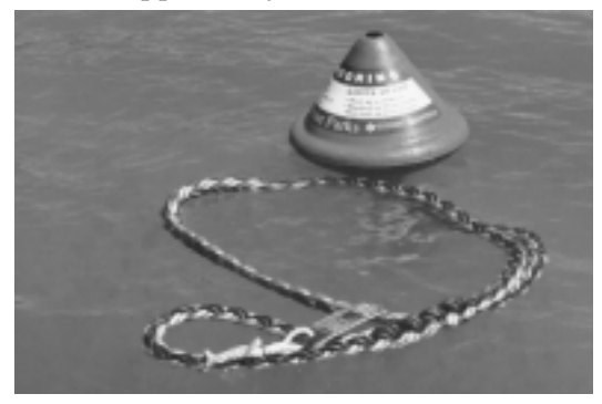
The standards allow for a range of moorings including public moorings

The GBRMPA is committed to the introduction of standard mooring buoys in the Marine Park. Permitted mooring owners will be advised directly of the standards required for mooring buoys, the unique reference number assigned to each of their moorings and will be encouraged to install standard mooring buoys at the earliest opportunity.