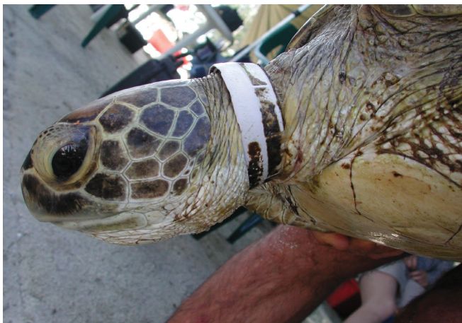
Green turtle with plastic debris around its neck at the Howicks, 150 kilometres north of Cooktown

Marine debris has an impact on all Reef values 12 — its beauty, rich biodiversity, extensive natural habitats, historic heritage, and Aboriginal and Torres Strait Islander cultural values.