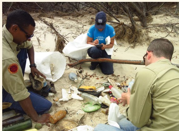
Yeppoon cyclone clean-up 2015

Aboriginal and Torres Strait Islanders are regularly involved in marine debris clean-up projects. Land and Sea Rangers work with Tangaroa Blue Foundation to remove thousands of tonnes of marine debris from remote and significant sites across Australia.