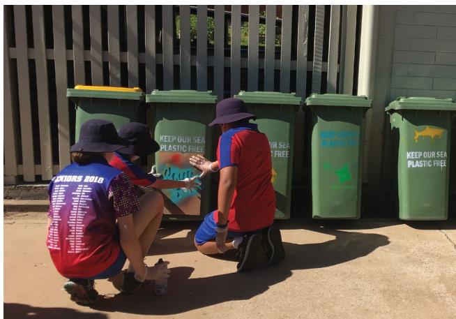
Reef Guardian School St Francis stenciling rubbish bins with Keep our sea plastic free

The Authority empowers and supports education and stewardship to help drive change to improve the health of the Reef. This is possible by working with Traditional Owners, Local Marine Advisory Committees and non-government organisations. Reef HQ Aquarium is the Authority's education centre which raises awareness of the impacts of marine debris through educational talks and tours including the Turtle Hospital.