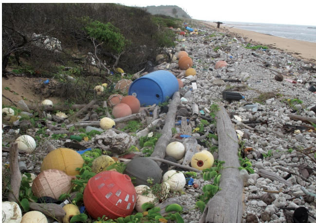
Marine debris washed up on Cape York beach

Plastic pollution is a high and increasing threat to the Reef. 2,3,4 More than 80 per cent of marine debris found in the Reef is plastic 3 , which includes macroplastics, microplastics, and abandoned, lost or otherwise discarded fishing and boating gear. Once plastic enters the ocean it can travel vast distances and break up into smaller pieces, which increases the risk of impacts. 5 The proportion of plastic in the Marine Park is greater in the north than the south, and may come from the land or sea. 6