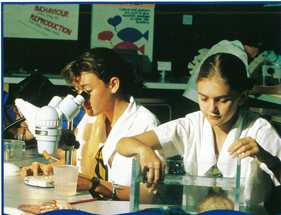
These innovative, hands-on experiences allow students to develop a better understanding of the reef.