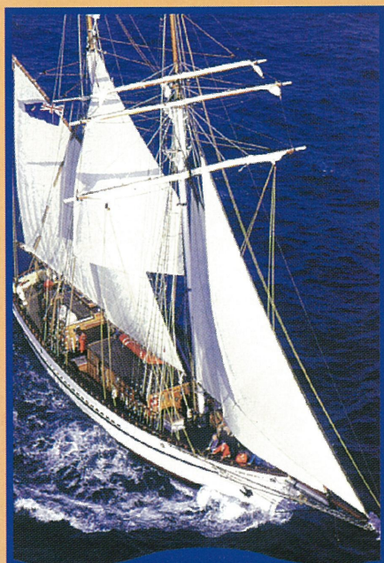
South Passage – special Members' activity during July.

Please phone (077) 500 800 immediately to book!