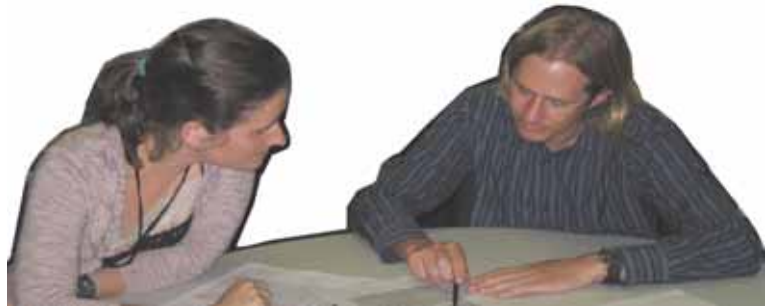
Two workshops were conducted as part of this project

A second Townsville workshop, held on 14 July 2010 and involving the whole Climate Change Group, finalised the MERI Framework. The Framework builds on the Program Logic to outline monitoring and evaluation questions, information required to answer them and data collection methods. The document also includes data collection tools and guidance for analysis and reporting.