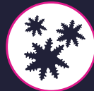
Crown-of- thorns starfish outbreaks