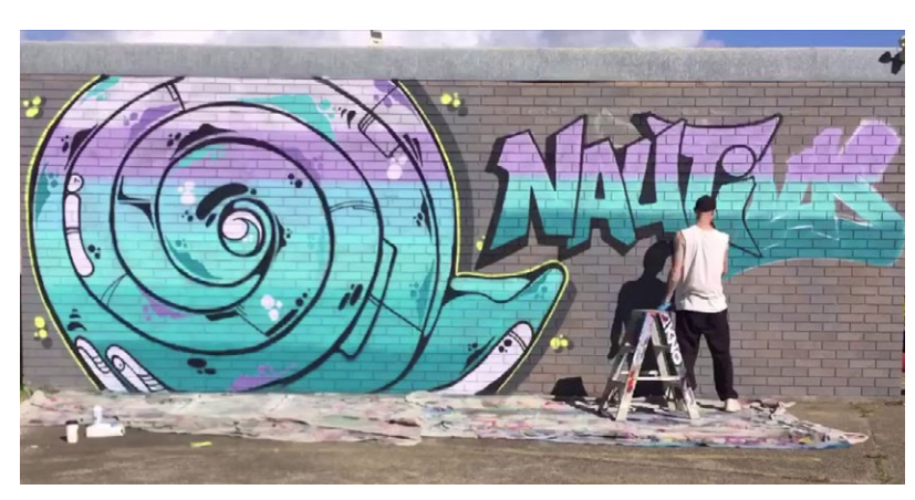
Nautilus Senior College, Mid North Coast Community College, Port Macquarie. Artist: Iknograffix

The logo can also be used as a stencil and used to print or screen print products (ie. Tote bags).