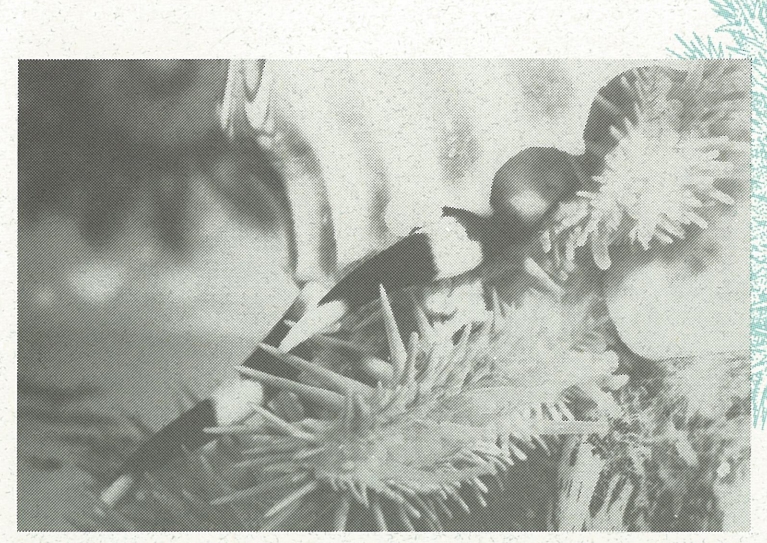
The giant triton shell (Charonia tritonis) is one of the few predators able to attack mature crown-of-thorns starfish.