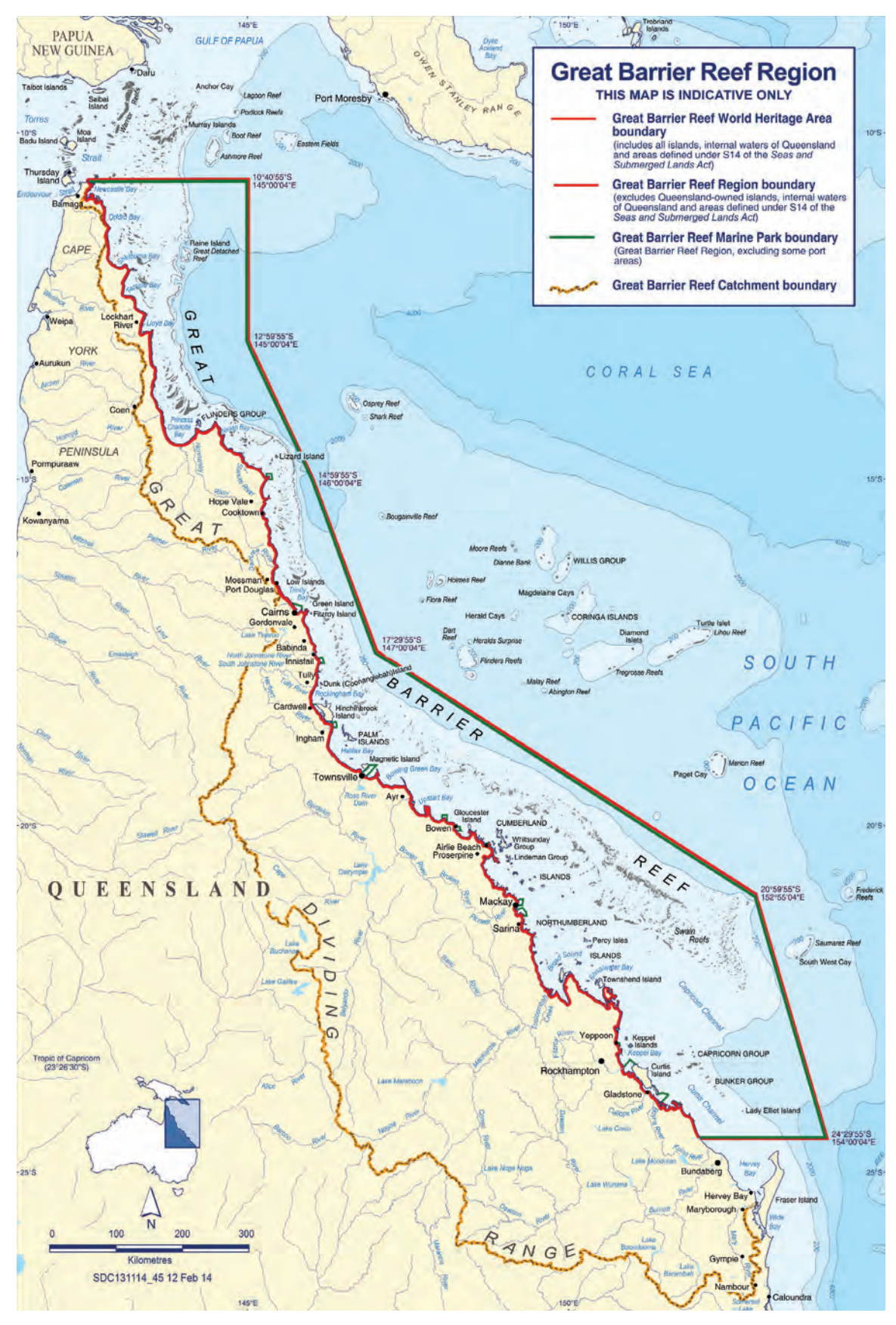
FIGURE 1. Great Barrier Reef World Heritage Area and Reef catchment

The geographical scope of the Reef Integrated Monitoring and Reporting Program includes the Great Barrier Reef World Heritage Area (red line) led by the Great Barrier Reef Marine Park Authority and the adjacent catchment (orange line) led by the Queensland Government.