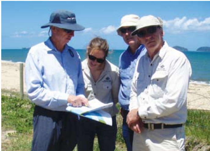
GBRMPA and Defence representatives discuss the latest management arrangements