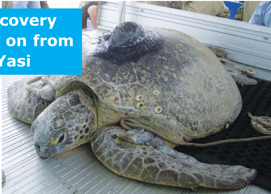
A tagged turtle waits to be released back into the Marine Park

The joint turtle tagging program between the GBRMPA and JCU in Cardwell that commenced mid last year will provide marine managers with information to make more informed management