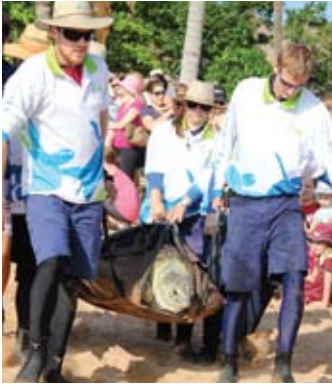
Cover: Reef HQ Turtle Hospital staff return the 150 kg green turtle Raylene to the water