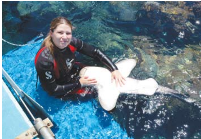
Reef HQ staff have been getting to know the resident leopard sharks