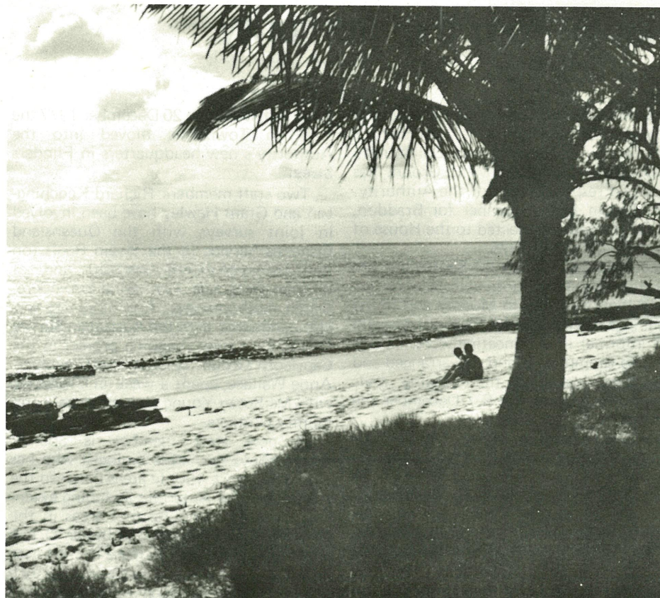
Peaceful, unspoilt beauty of the Great Barrier Reef.

Inquiries: Queensland National Parks and Wildlife Service, P.O. Box 190, North Quay, Qld. 4001.