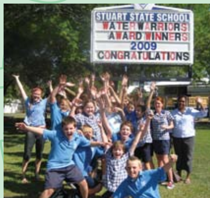
Stuart State School students in front of their school sign that proudly announces their Reef Guardian Award