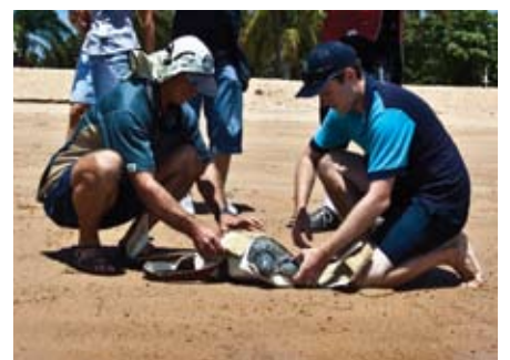
Wunjunga the green turtle about to be released

Reef HQ Aquarium turtle hospital was officially opened by Federal Environment Minister Peter Garrett on 24 August 2009. The hospital plays a key role in rehabilitating turtles so they can be released back into the Great Barrier Reef Marine Park.