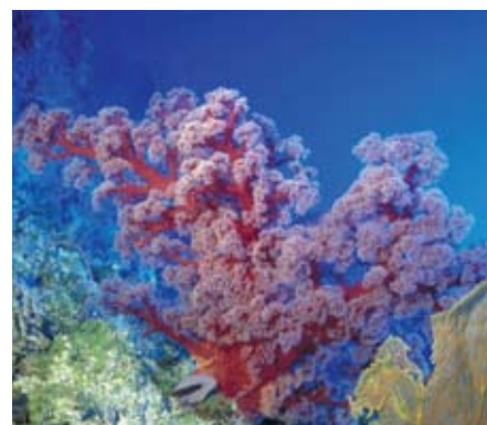
The search is on for unknown Reef species

"This is a great partnership between government and industry to build our scientific knowledge."