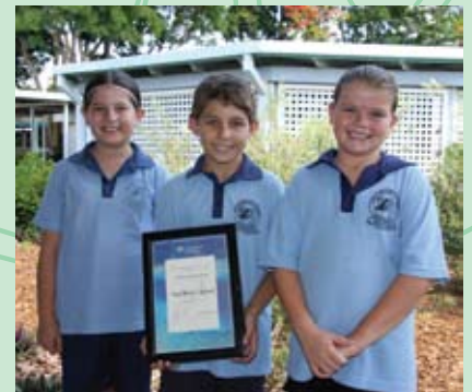
Proud Gordonvale State School students with their Sea Stars Award

The Gordonvale Sea Stars have led the way in many projects and developed working relationships with Mulgrave Landcare and Catchment Group, Cairns Regional Council, Ergon Energy and local businesses to get their projects up and running.