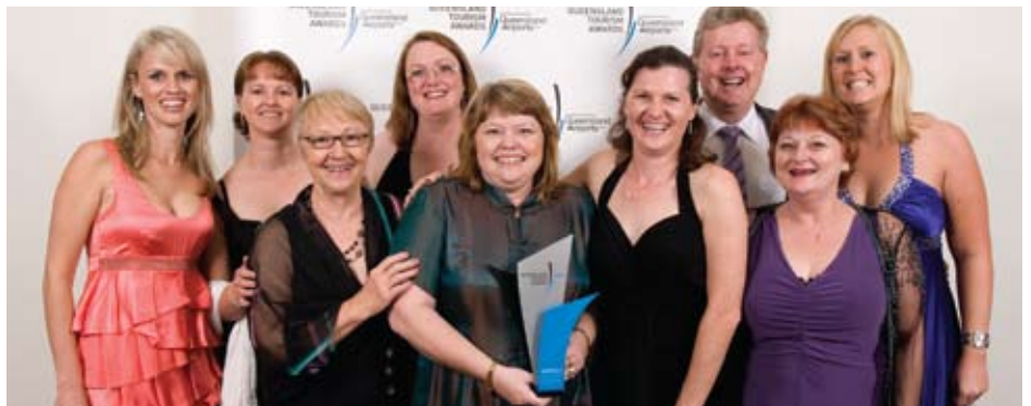
Proud members of Reef HQ Volunteers Association Management Committee accept award supported by Great Barrier Reef Marine Park Authority Chairman and staff

"Visitors experiences of Reef HQ Aquarium and the Great Barrier Reef are enriched by our volunteer group and this award is certainly well-deserved," he said.