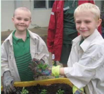
Clinton State School students tend their wheelbarrow veggie patch

Clinton State School's Learning Legends use the outdoor classroom as inspiration, encouraging activities that have a Reef protection focus.