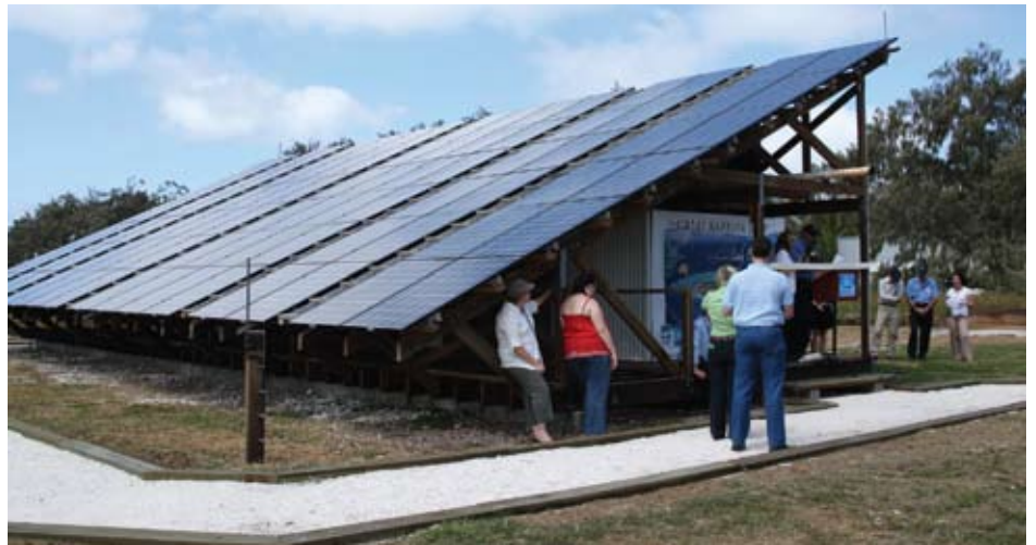
Lady Elliot Island Eco Resort's off-grid three-phase solar hybrid power system is the largest privately owned in Queensland

The combination of solar and gas technology, water desalination and various other actions have been introduced across the island steering it towards its Advanced Ecotourism certification.