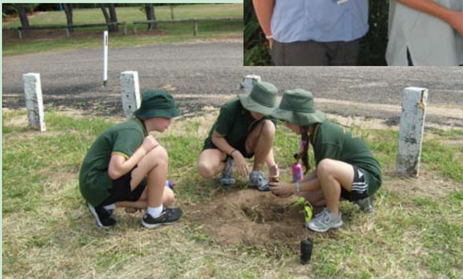
Burdekin Christian College students plant trees during a Reef Guardian activity

Winner: Port Douglas State School Action and Adventures at Port Douglas included riding push bikes to sporting and other events such as beach clean ups reducing the schools environmental footprint.