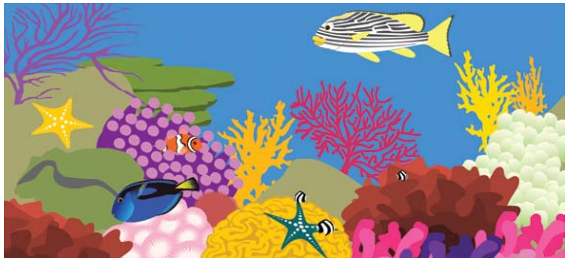
Climate change impacts on the Reef feature in new animations

A lonely hermit crab and a colourful collection of coral polyps join a cast of characters featured in a series of animations designed to teach kids about the impacts climate change will have on the Great Barrier Reef.