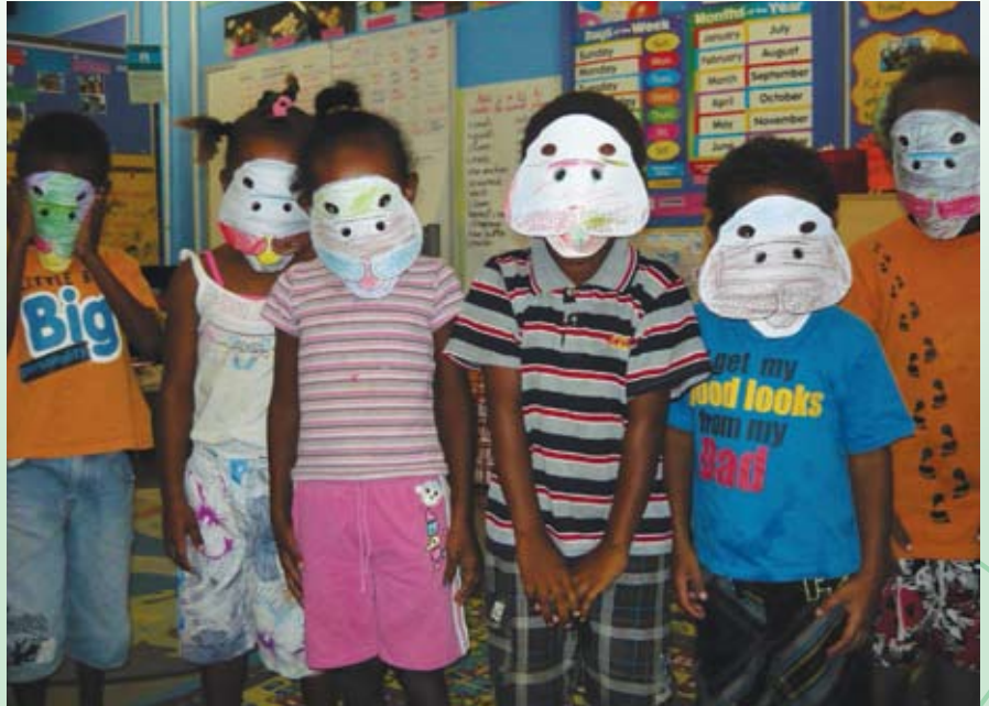
Tagai College students wear their hand-made dugong masks during a Reef Guardian activity

Tagai College Champions have provided mentoring and support for all 16 satellite primary schools in the Torres Strait.