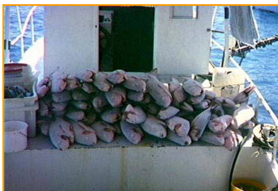
Coral trout (pictured frozen on a commercial vessel) are one of the main target species for the coral reef fishery.

Since the mid-1990s there has been a progressive shift in the commercial sector toward supplying live reef fish to the Asian market. In 2001, half the commercial coral trout catch and a quarter of the total coral reef fish catch were exported live to China.