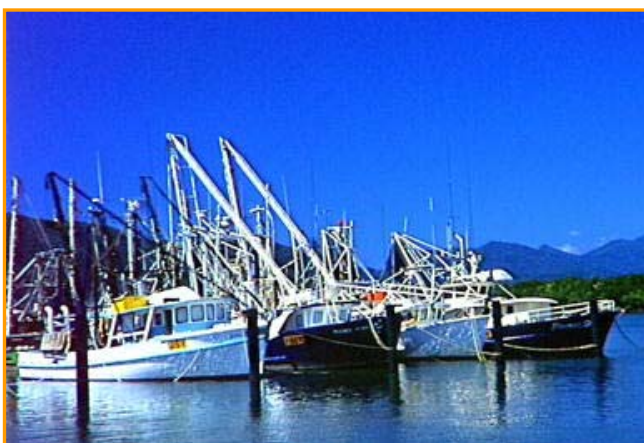
The trawl fishery in the GBRMP occurs predominantly within the Great Barrier Reef lagoon, the area between the Queensland coastline and the western margin of the mid-shelf

The fishery has several components. The banana prawn fishery is an inshore fishery, which occurs during daylight in water depths of less than 25 metres. In the Great Barrier Reef lagoon, the tiger and endeavour prawn fishery is a night time fishery, which occurs over sandy and muddy bottoms in water depths of less than 20 metres. The offshore fisheries target king prawns in the central and northern sections of the Marine Park at night (30-50 metre depth) and scallops in the southern sections of the Marine Park at night (20-60 metres). In addition, Moreton Bay bugs are a valuable part of the catch in some areas (such as off Townsville and Gladstone).