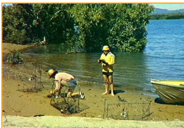
The mud crab fishery operates mainly in intertidal areas outside the GBRMP. There are concerns over current levels of effort and localised depletions of stocks.

The spanner crab fishery operates mostly outside the GBRMP with only about 5 percent of the catch being taken from the GBRMP. The spanner crab fishery is managed with a Total Allowable Catch (TAC). The main issue of concern in this fishery is the consistent decline in Catch Per Unit Effort (CPUE) in the fishing area within the GBRMP. CPUE is used to assess the health of fished stocks.