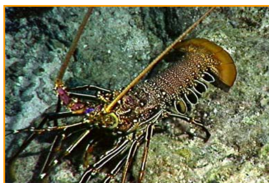
The commercial tropical rock lobster fishery is managed on a limited entry basis and is restricted to north of 14° S latitude.

The commercial fishery is managed on a limited entry basis and is restricted to north of 14° S latitude (centred on three reefs off Shellbourne Bay). The commercial fishery is subject to a closed season (October to January inclusive) for spawning stock protection, a minimum size limit and prohibitions on the taking of berried females. Take must be by hand or hand-spear only. Underwater breathing apparatus may be used in the commercial fishery. There is no bycatch associated with this fishery.