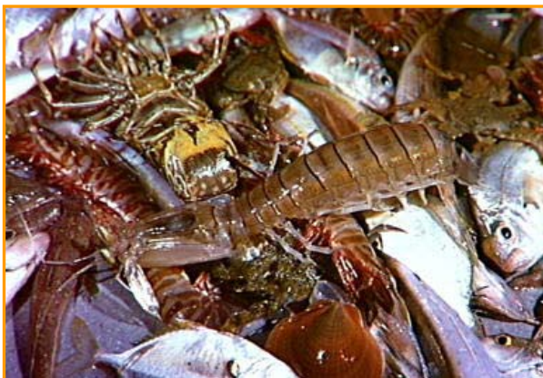
Part of the ECTF Management Plan involved the capping of effort and introduction of TEDs and BRDs.

In August 2001, following extensive negotiations, the Queensland Government implemented an effort cap on trawling in the GBRWHA. This cap ensures that there will be no migration of trawl effort into the Marine Park, following the removal of fishing licences and their associated effort under a structural adjustment scheme. As of late 2002, the number of vessels permitted to operate in the fishery was 530. Following this legislative amendment, the GBRMPA accredited the ECTF Management Plan as ensuring an ecologically sustainable trawl fishery in the Far Northern Section of the GBRMP. In making this decision the GBRMPA was mindful that almost 80 percent of the Far Northern Section of the Marine Park is closed to trawling under Great Barrier Reef Marine Park zoning or Queensland fisheries legislation.