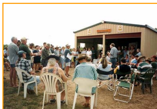
User groups and communities are consulted and involved in the development of Marine Park zoning and management plans, such as occurred at this meeting of GBRMPA staff and Midge Point community members.

Fishing was the key focus of an enhanced compliance strategy that began in July 1999. High priority areas included dugong protection, trawling and line fishing in protected zones. Assisted by additional Commonwealth Government funding, the strategy included enhanced patrol activities, development of an integrated intelligence-based planning system and use of a range of new technologies. The strategy has seen a significant increase in the rate of detection and prosecution of illegal fishing activity in the Marine Park. The GBRMPA also has access to the satellite-linked vessel monitoring system developed by the QFS for trawlers and vessels involved in the sea cucumber and trochus fisheries.