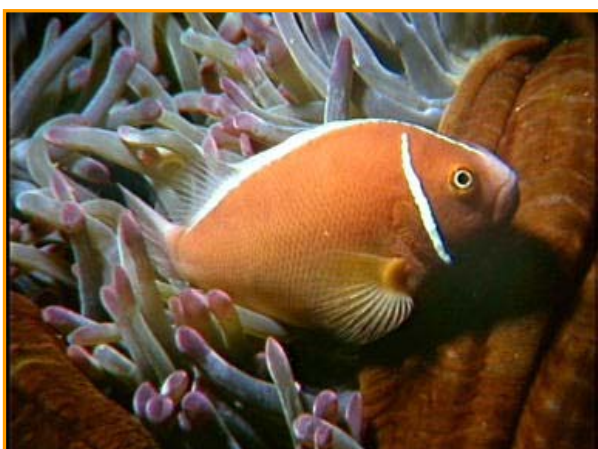
There are concerns over the potential for localised depletions for some aquarium fish species

The marine aquarium fish fishery is managed by input controls (on apparatus, number of participants, number of divers and area of operation). Commercial fishers are limited to collection of fishes by hand or by using lines or cast, scoop or mesh nets; however underwater breathing apparatus may be used. It is a limited entry fishery, with some 60 transferable authorities. Recreational aquarium fish collection also occurs, however only limited catch and effort information is available. There is no bycatch associated with this fishery.