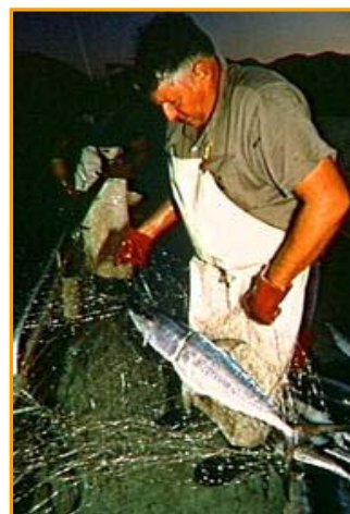
The QFS has indicated that it will prepare an Inshore Finfish Fishery Management Plan once arrangements for the coral reef finfish fishery are finalised.

whose operating costs are more modest than those in the otter trawl or coral reef finfish fisheries. The Queensland Fisheries Service has indicated that once management arrangements for the coral reef finfish fishery are finalised, resources will be directed to preparing an East Coast Inshore Finfish Fishery Management Plan. Recent changes to fisheries regulations relating to netting and finfish resources targeted by this fishery have been implemented in response to specific management priorities. The main issues in the fishery are ecological sustainability of current levels of effort, latent effort (substantial number of unused or under-utilised commercial netting endorsements), concerns over possible interaction with species of conservation concern, and strong opposition to commercial netting in near-shore areas and estuaries from recreational fishers and the wider community.