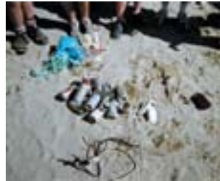
The rubbish collected by Pialba State School on Woody Island

In other Reef Guardian School activities at Pialba State School, grade four students are studying a whale unit that will see them head out to the Reef for some whale watching and the entire school has recently been involved in a 'Tree Planting Day', where each year level planted a 'Bush Tucker' plant in their gardens.