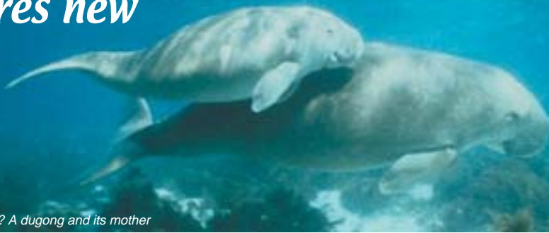
Homebody or hoon? A dugong and its mother