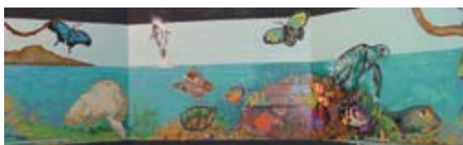
The Belgian Gardens mural featuring a dugong and marine turtle