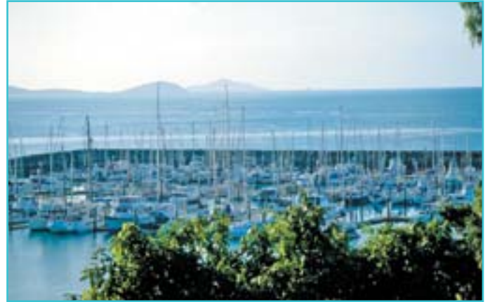
Whitsunday marina development is putting the coast under pressure

"The day was perfect for the trip and six turtles were spotted. The adults seemed even more excited than the kids."