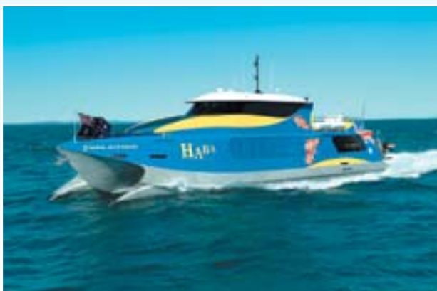
Haba Dive's new wavepiercing catamaran "Evolution"