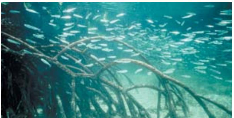
Young fish find shelter in mangrove roots