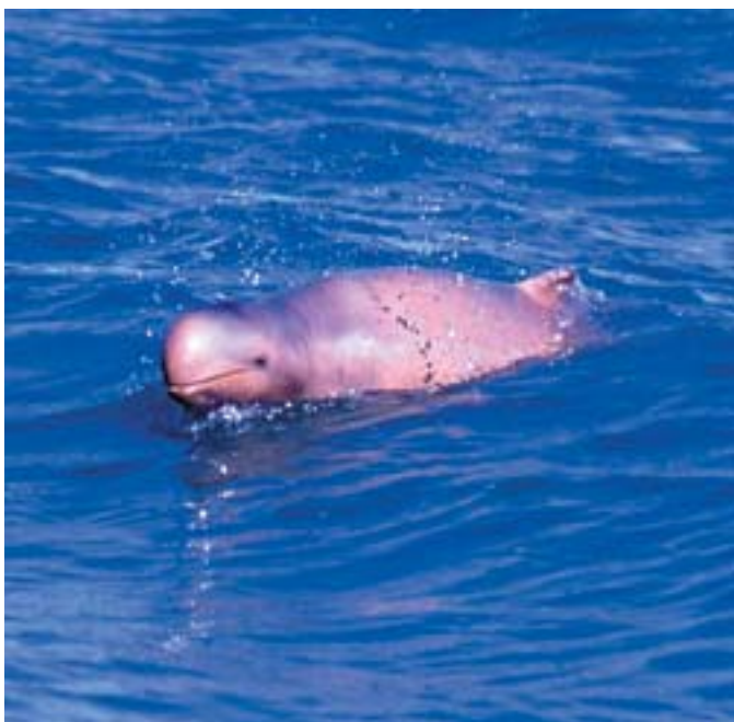
The Australian snubfin dolphin.

A new species of dolphin has been recognised in Australia and it is known to occur in the Great Barrier Reef.