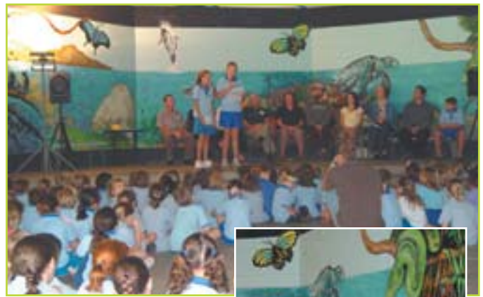
Students from Belgian Gardens State School unveil the Reef Guardian School mural