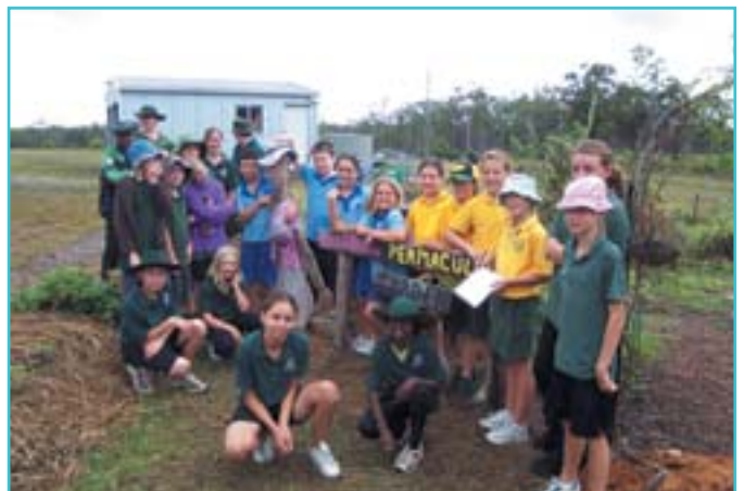
Reef Guardian students work together to protect our Reef for the future

"Most importantly, students are educating their community on better environmental practices and are changing peoples actions for a more sustainable future. Students are developing their own brochures, television advertisements, radio programmes, boat ramp signs and are actually getting into the community to educate others."