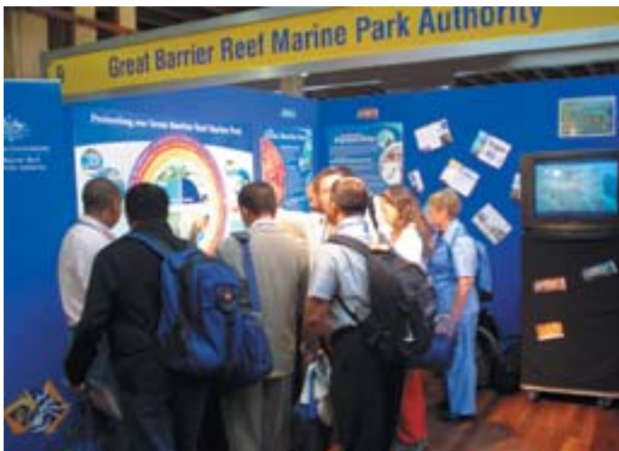
The GBRMPA display at the IMPAC conference was a great success