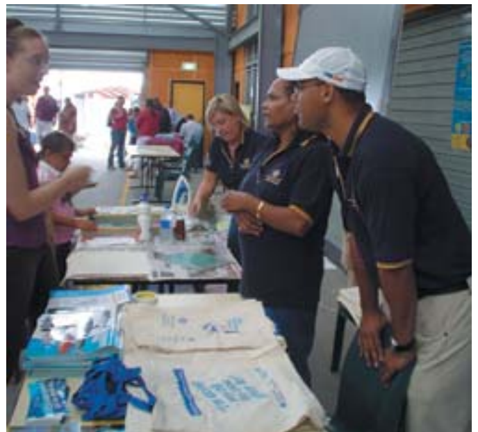
GBRMPA staff share their knowledge and information with the Palm Island community