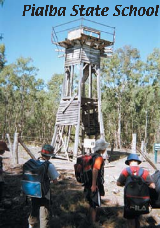
Grade five students explore the ruins of the old lighthouse

As a part of the Reef Guardian School programme, grade five students at Pialba State School in Hervey Bay recently headed to Woody Island to study its flora, fauna and history.