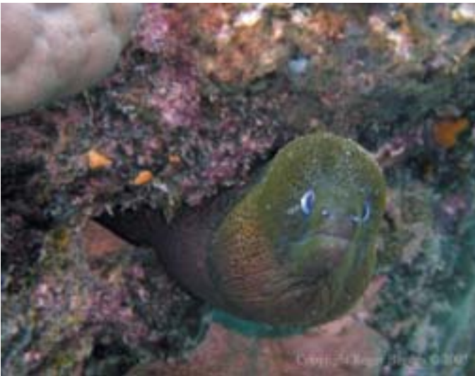
Chloe Lucas discovered amazing creatures enjoying their habitat

Last month volunteers from Reef Check Australia discovered the hidden treasures of the Palm Islands fringing reefs. While they're tantalisingly close, most of these reefs are rarely dived. The expedition marked the first stage of an Envirofund project to monitor the health of inshore reefs in the Burdekin region.