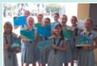
St Margaret Mary's College students in Townsville with their competition entries

A big thank you to all schools who submitted entries.