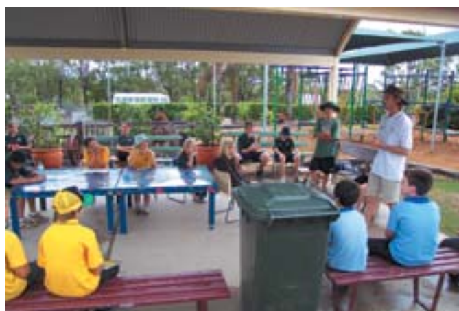
Students meet to discuss 'Sustainable Oceans' in 2005