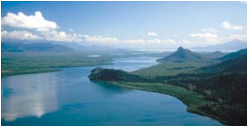
Connecting wetlands – river to reef