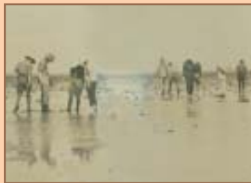
Snapshot of the coast – scientists at Low Isles in 1928 (photo from A Year on the Great Barrier Reef by Sir Maurice Yonge)

If this cycle continues to happen with each generation we will not see the failing health of many animal species and habitats.