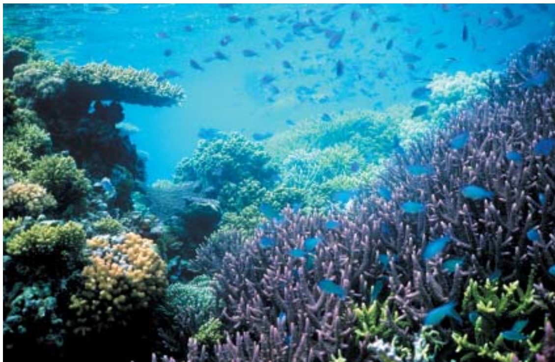
IYOR is a celebration of the unique coral reefs around the world

2008 marks the International Year of the Reef (IYOR '08), an activity of the International Coral Reef Initiative (ICRI) designed to continue the global focus on the importance of coral reefs to the health of the planet.