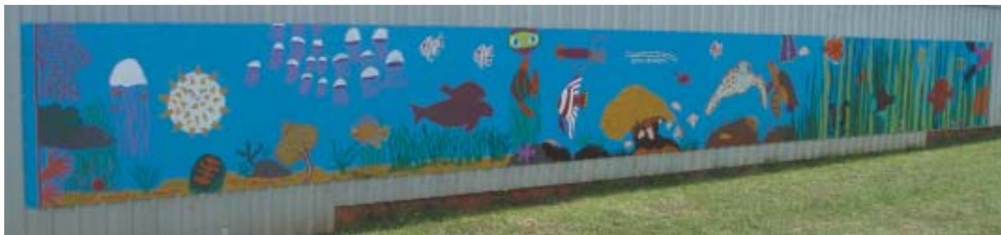
The completed mural at the school

"The mural is a great tool to use when reminding kids not only of the beauty of the Reef but also of the impact that our actions up here can have on the Reef."