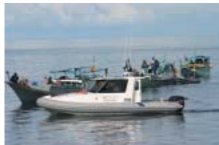
Patrols help protect the Reef from foreign fishing vessels

Boaties and fishermen are also encouraged to keep an eye out and report any illegal foreign fishing activities to Customs Watch on 1800 061 800.