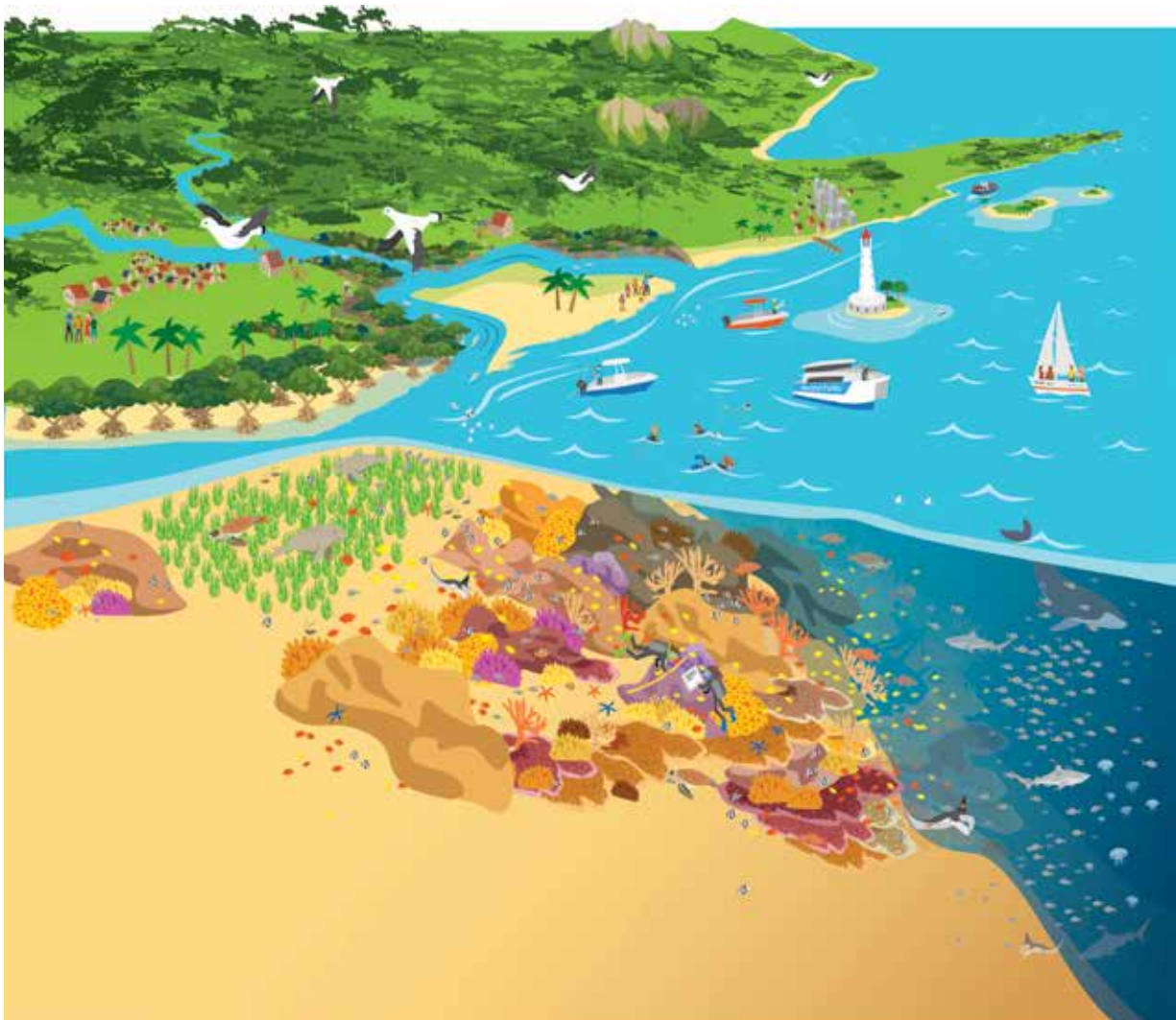
Figure 1: The Great Barrier Reef is a large, diverse, biocultural, multiple use marine protected area.

This joint arrangement — which operates across the Commonwealth Marine Park and the Queensland Great Barrier Reef Coast Marine Park — includes delivering on-ground conservation actions, monitoring ecological and heritage values, responding to incidents, welcoming people and upholding compliance with the Great Barrier Reef Marine Park Zoning Plan. Engaging and involving Aboriginal and Torres Strait Islander peoples in field management is an intrinsic part of program delivery.