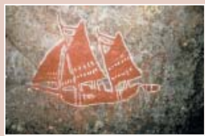
Rock art occurs on some islands, and along the coastline of the Great Barrier Reef

For more information on the strategy, contact the Indigenous Partnerships Liaison Unit on freecall 1800 802 251, telephone (07) 4750 0700, or email indigenous_partnerships@gbrmpa.gov.au.