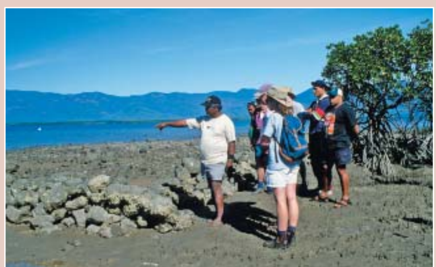
Fish traps, such as the stone structure shown above, use the incoming tides to trap fish