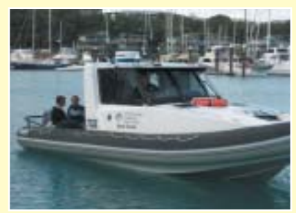
The new fast response vessel

These include the Queensland Parks and Wildlife Service, Queensland Boating and Fisheries Patrol, Customs National Marine Unit, Coastwatch and the Great Barrier Reef Marine Park Authority.