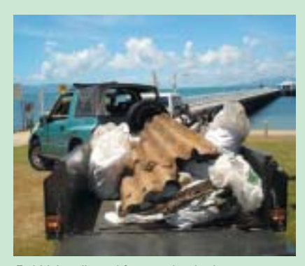
Rubbish collected from under the jetty at Picnic Bay, Magnetic Island