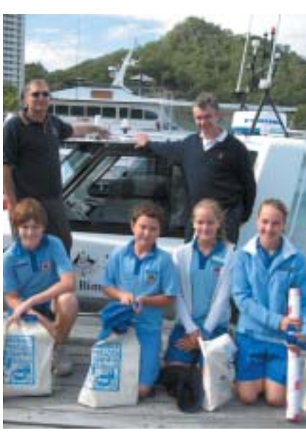
Reef Guardian School Students from Cannonvale State School at the launch of the new fast response vessel on Hamilton Island