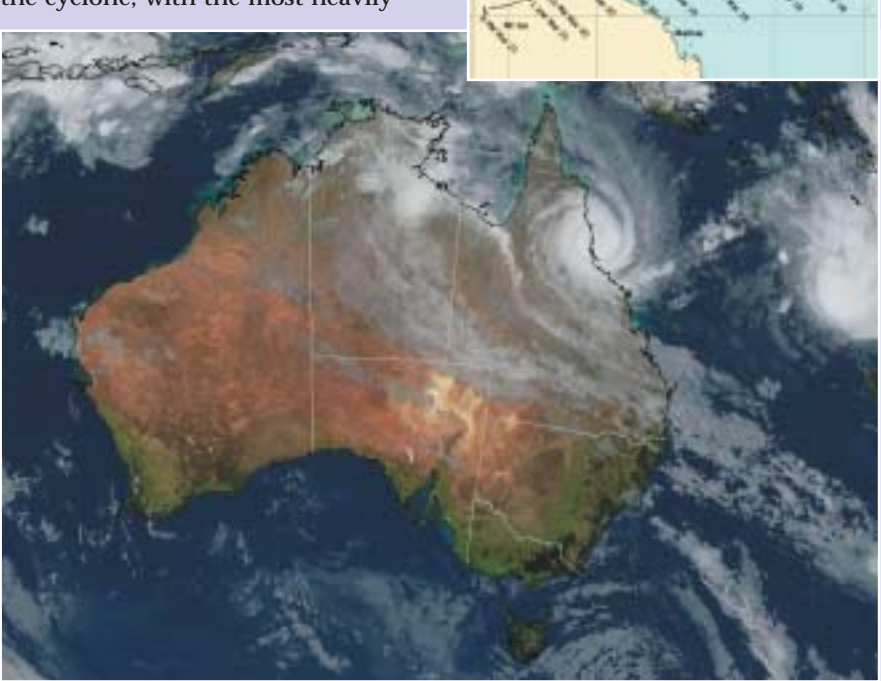
A satellite image of cyclone Larry crossing the Queensland coast

Cyclone Larry is tracked as it crosses through the Great Barrier Reef and over the Queensland Coast