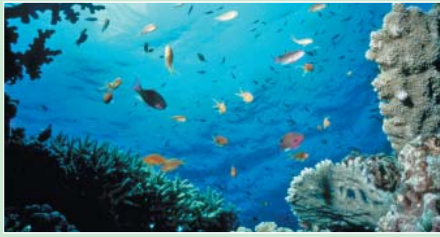
The new partnership looks at water quality in the Marine Park

"The partnership supports and co-ordinates water quality target setting, monitoring and reporting to help make the link between management actions in the Great Barrier Reef catchments and the health of Great Barrier Reef lagoon ecosystems," he said.