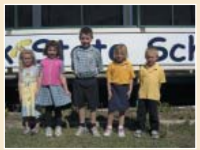
GBRMPA Community Partnerships Group recently met students from the remote Mistake Creek State School

Mistake Creek State School's six students recently attended a reef sleep at ReefHQ.