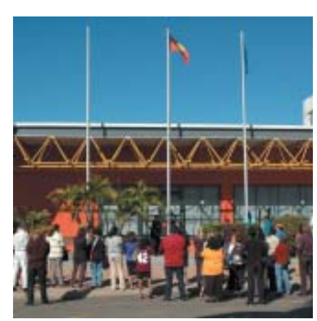
The flag raising ceremony was just one of the events to take place during NAIDOC week

Personal accounts of peoples' use and attachment to sea country were also held, along with a seminar on the history of NAIDOC and video sessions about Native Title.