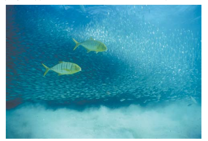
Figure 18.3 Baitfish are a critical source of food for piscivores: Golden trevally patrolling a school of bait fish (hardy heads)