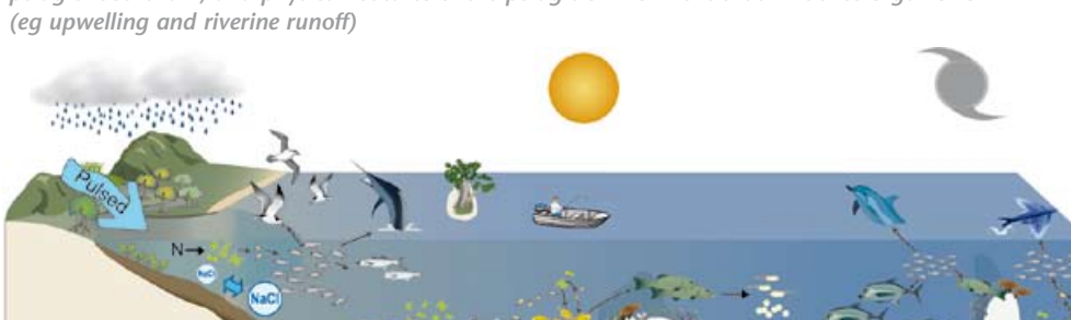
Figure 18.1 Profile of the GBR from inshore to offshore showing key organisms of the tropical pelagic food chain, and physical features of the pelagic environment that influence organisms (eq upwelling and riverine runoff)

This review focuses on pelagic environments. The oceanography of the Great Barrier Reef (GBR) is dynamic and is the physical template to which organisms respond. Planktonic assemblages are the basis of pelagic food chains and they provide a rich supply of food for high trophic groups (eg fishes, birds and whales) as well as the larvae and adults of benthic assemblages (Figure 18.1). Changes in pelagic systems, therefore, cannot be viewed in isolation from other habitats (such as coral reefs). Plankton ranges from tiny viruses (less than 1 micron) and bacteria, to larger plant (phytoplankton) and animal plankton (zooplankton). Jellyfish are the giants of the plankton world and can reach