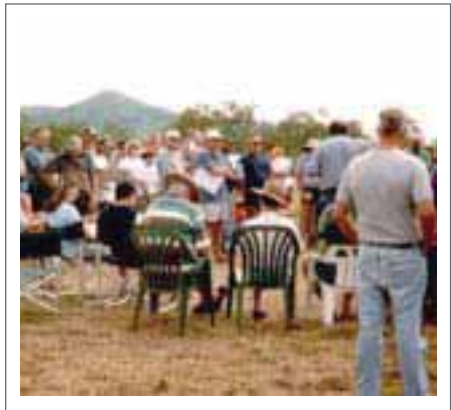
One of the many meetings held out in the various local communities along the Great Barrier Reef coast to explain the zoning process and to encourage public submissions as an important part of the planning programme.