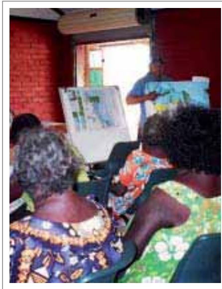
GBRMPA staff conducted community information sessions in over 90 centres along the coast, enabling interested individuals to get information and ask questions.