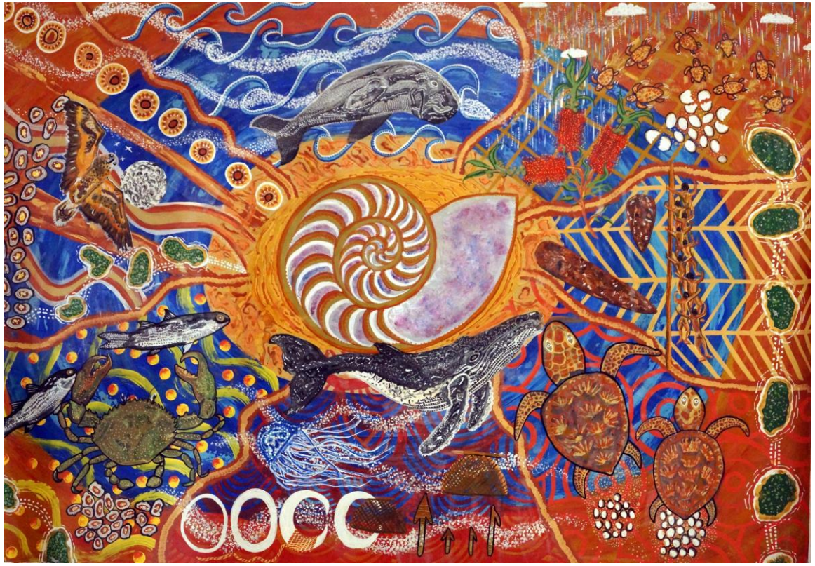
Figure 3 : Woppaburra seasonal calendar/cultural mapping – Nautilus shell (Yilum). Art work by Aboriginal artist Glenn Barry (completed February, 2016).