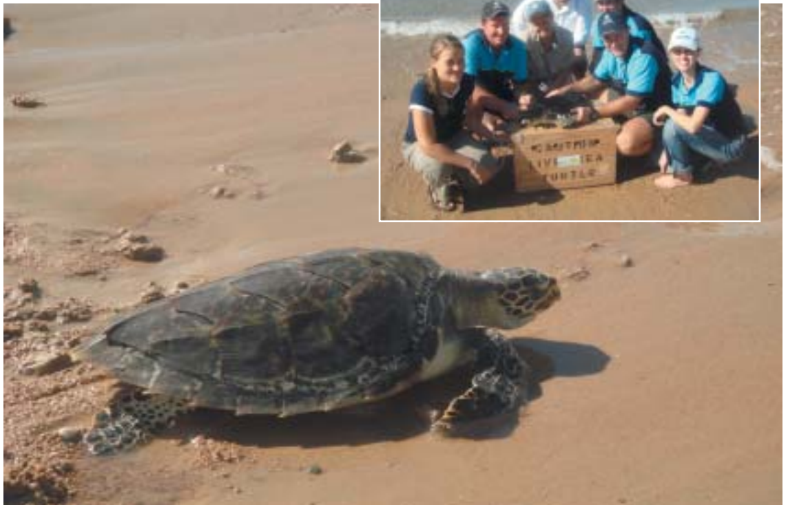
Alva is released off Magnetic Island

Alva a hawksbill turtle was released off Magnetic Island, just in time for World Turtle Day, thanks to Reef HQ Aquarium and the Department of Environment and Resource Management.