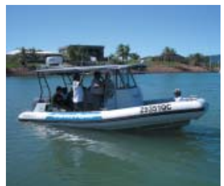
Territory visitors took time out to accompany field staff on a boat patrol

The Anindilyakwa Land Council represents the Aboriginal people of the Groote Eylandt archipelago located on the western side of the Gulf of Carpentaria, around 600 kilometres East, South East from Darwin.