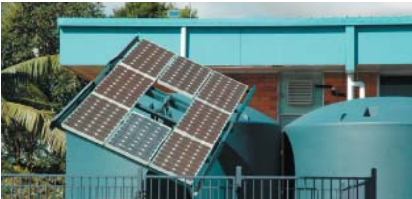
Solar power panels can be installed at home to reduce electricity use