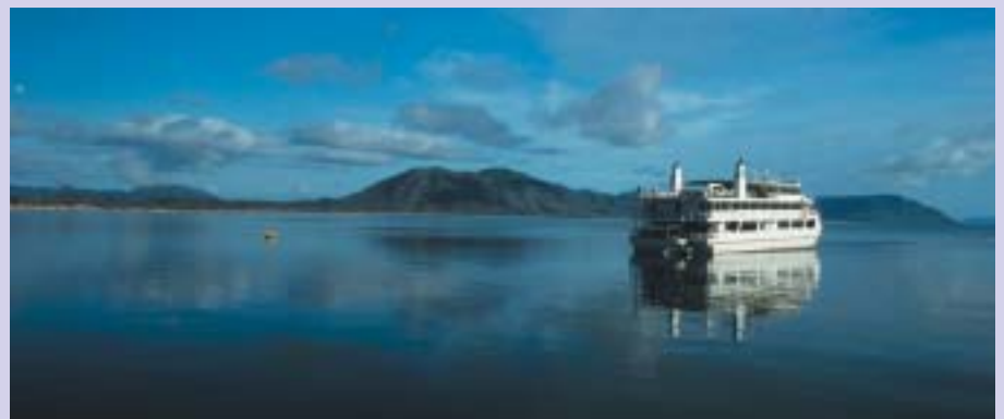
Tourism operators can prepare their businesses for the future by developing strategies to adapt to climate change

The workshops were delivered by the Great Barrier Reef Marine Park Authority in partnership with the Association of Marine Park Tourism Operators and included a presentation by Ecotourism Australia on their recently released Climate Change Action Certification program.