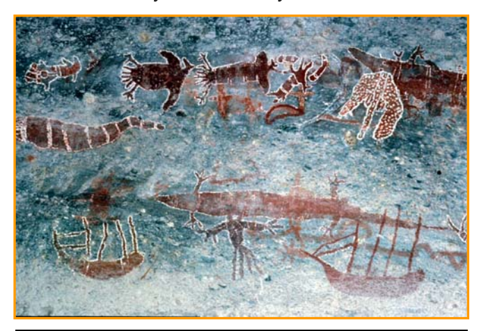
Aboriginal and Torres Strait Islander people have a unique maritime culture.

As sea-faring peoples, Torres Strait Islanders travelled through the Reef's waters for trade with mainland Aboriginal groups along the east coast, as well as to collect resources for their subsistence lifestyles. To do this they travelled vast distances in outrigger canoes using the wind and the constellations as navigation guides. Their myths and legends of the sea are expressed through dance and song and there are many creation stories for the region's islands and reefs.