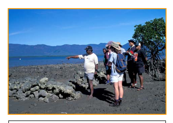
Cross-cultural education provides an excellent opportunity to learn about Aboriginal cultures.

As part of GBRMPA's cross cultural education program, a cultural education camp to Goold Island was organised for Queensland Parks and Wildlife Service (QPWS) and GBRMPA staff in 2002. The Girringun Elders and Reference group at Cardwell were contracted to provide the cultural learning outcomes as well as the camp logistics with the assistance of the QPWS vessels. The camp provided excellent opportunities for sharing and understanding Aboriginal cultures, traditional rights and interests in the Marine Park and how to facilitate the development of better working relationships in the future.