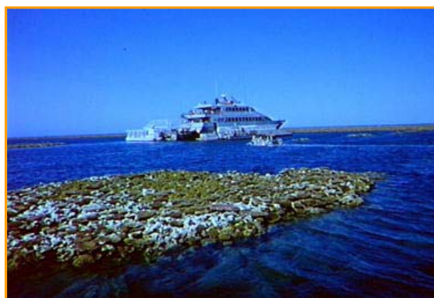
For many visitors to the GBRMP the tourism fleet is their primary means of experiencing the Great Barrier Reef.

International, national and regional visitors are drawn to the Great Barrier Reef and for