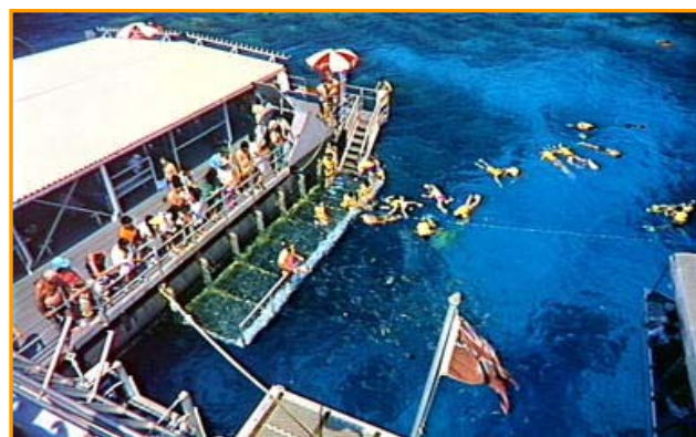
Plans of Management are designed to provide environmental protection, particularly at high-use and sensitive sites.

Every tourism operator is required to hold a permit for the operations being conducted in the GBRMP. This permit is jointly issued by the GBRMPA and QPWS and covers activities in the GBRMP and adjacent State Marine Parks. Through these permits, the activities that may be undertaken by each operator are defined and any necessary conditions are described. Each permit application is assessed by the managing agencies. If considered necessary, applicants may be required to prepare an Environmental Impact Statement or to provide public notice of their intentions. This is more likely where the proposal includes the installation and operation of structure within the GBRMP.