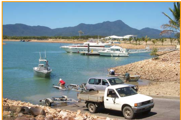
Recreational vessel registration is increasing in communities adjacent to the GBRMP.

The number of visitors carried on commercial tourism operations in the GBRMP is presented in the graph below, along with a breakdown of visitors to the Cairns Area and the Whitsundays. Tourism numbers have been relatively stable since 1994. The minor decline in 1997/98 is attributed to the Asian economic crisis. In 2001, the Cairns area recorded a notable increase, which is attributed to post-Olympic interest in Australia. There has been a 43 per cent increase for the Whitsundays since 1996.