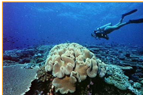
Diving is a popular activity for tourists visiting the GBRMP.

The tour vessels used by operators range in size from small sailing vessels, which typically take fewer than 20 people, to the large wave-piercing catamarans, which carry up to 400 people. There are also an increasing number of cruise ships visiting the GBRMP, with bookings to cruise ship anchorages increasing from about 200 in 2000, to nearly 600 in 2002.