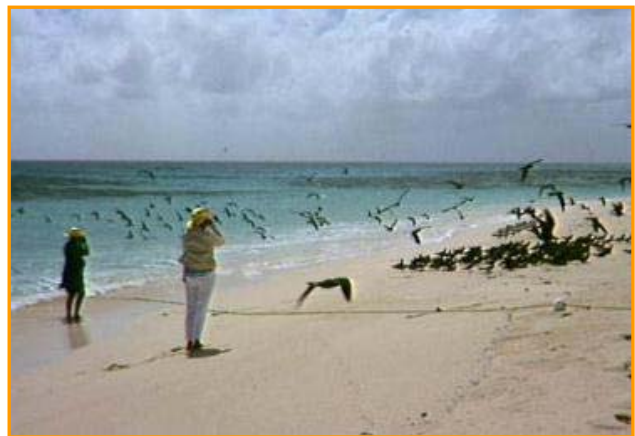
Particular management focus is given to protecting seabirds from disturbance, especially during nesting seasons.

The Tourism and Recreation Group is undertaking a number of projects to address high priority tourism and recreation issues.