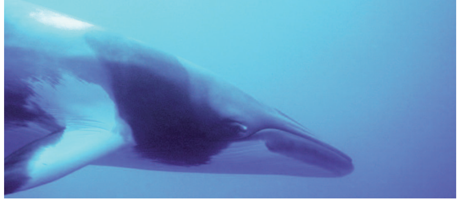
Dwarf minke whale, Balaenoptera acutorostrata – unnamed subspecies, showing characteristic white pectoral flipper markings and dark smudge above the throat.