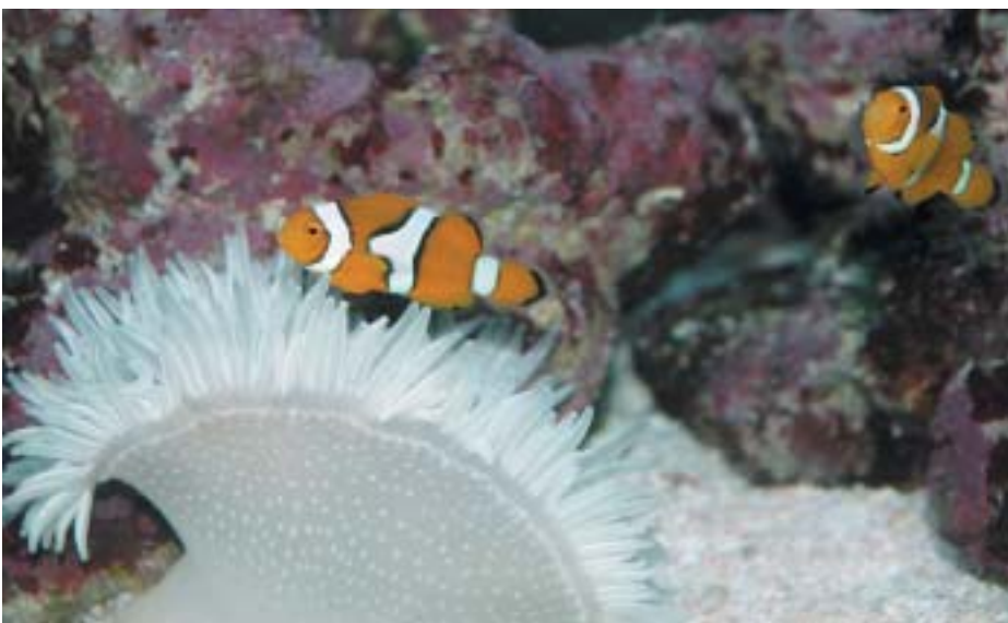
Baby clownfish are also on display at Reef HQ