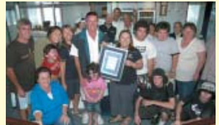
Airlie Beach Camp Quality trip