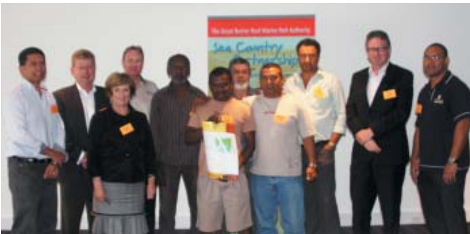
Accrediting the Wuthathi Traditional Use of Marine Resources Agreement

The agreements were accredited by the Marine Park Authority Board in June, with formal ceremonies to mark the occasion later this year.