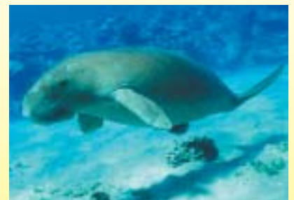
Dugong feed on seagrass

More than 5000 km 2 of seagrass habitat have been mapped so far within the Great Barrier Reef Marine Park. While this is an impressive area, it represents less than 1.5 per cent of the total area of the Marine Park.