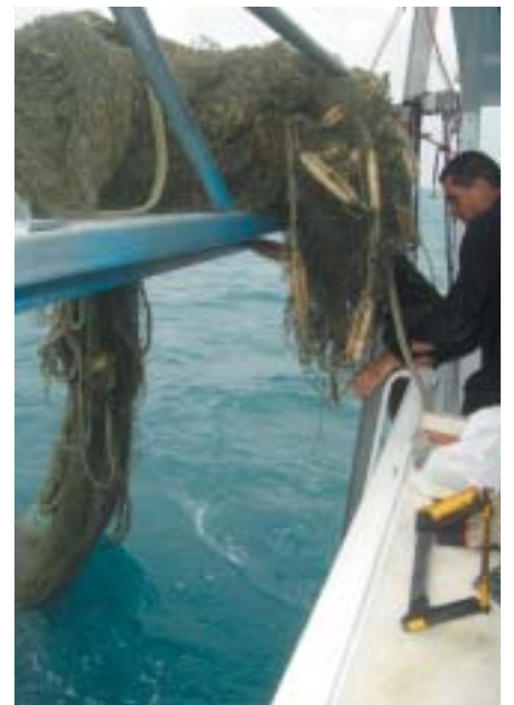
Part of the ghost net being hauled on to the mother vessel