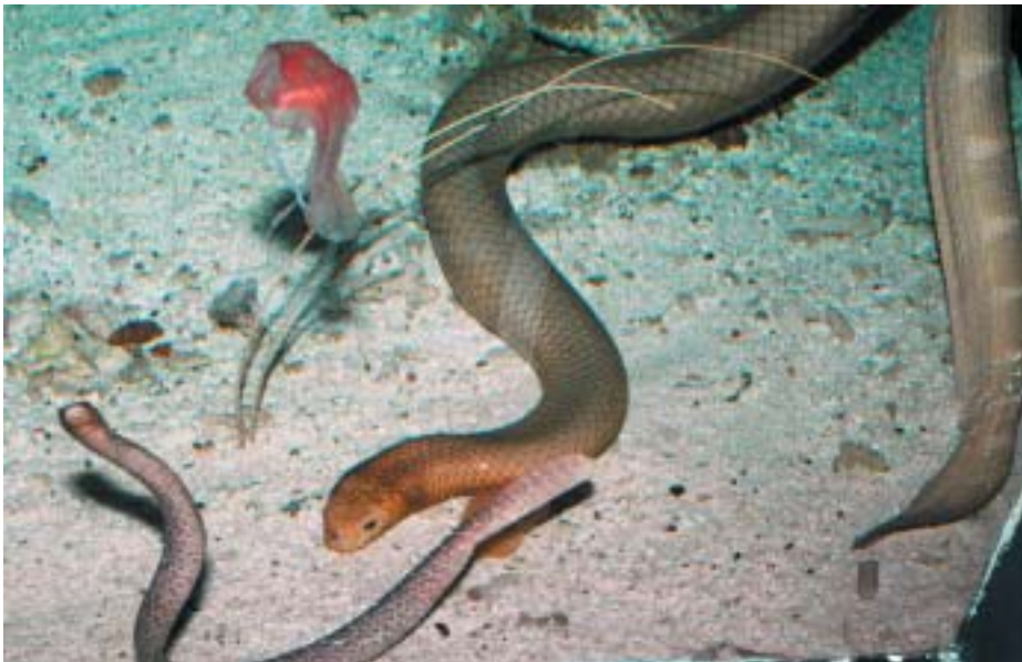
Sea snakes are born at Reef HQ

You can view the sea snakes at Reef HQ Aquarium, open from 9.30am to 5pm, seven days a week, every day of the year except Christmas Day.