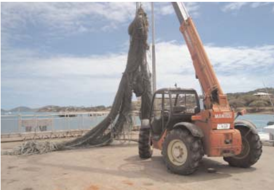
A crane used to remove the ghost net

Ghost nets posing a traffic or shipping hazard can be reported to the Australian Maritime Safety Authority on 1800 641 792. Ghost nets found in the Marine Park can be reported to GBRMPA on (07) 3830 4919 (24-hrs).