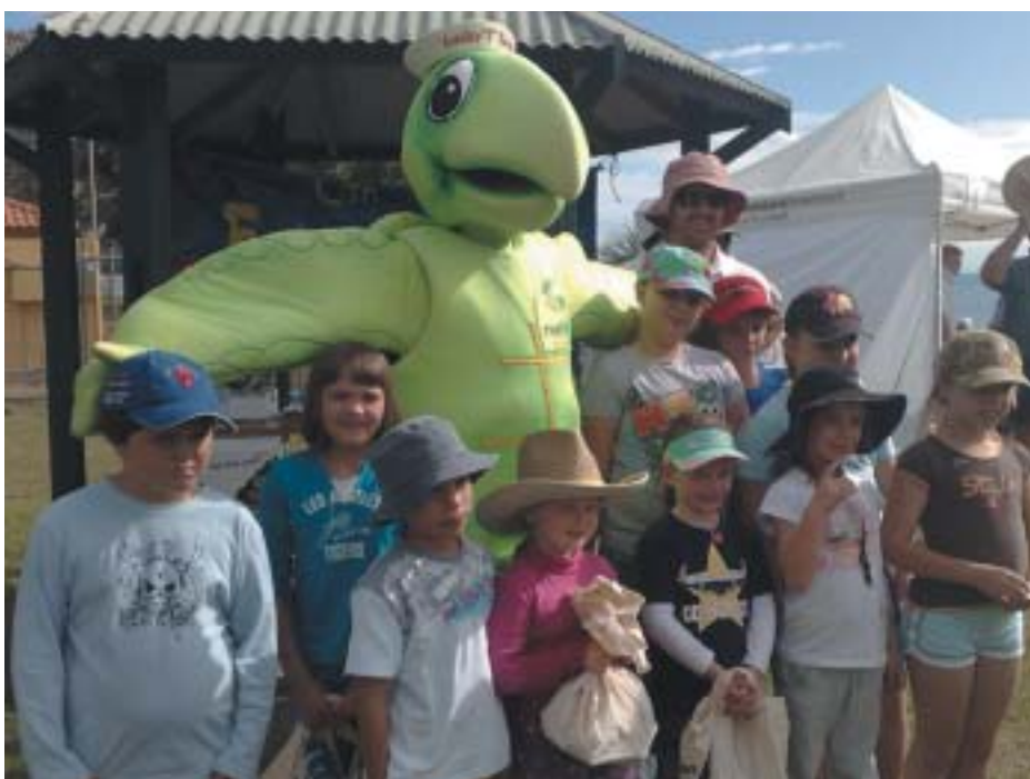
Lucky T makes a special visit to fishing classic

The Fishing Classic was an extremely successful event with about 240 children turning up.