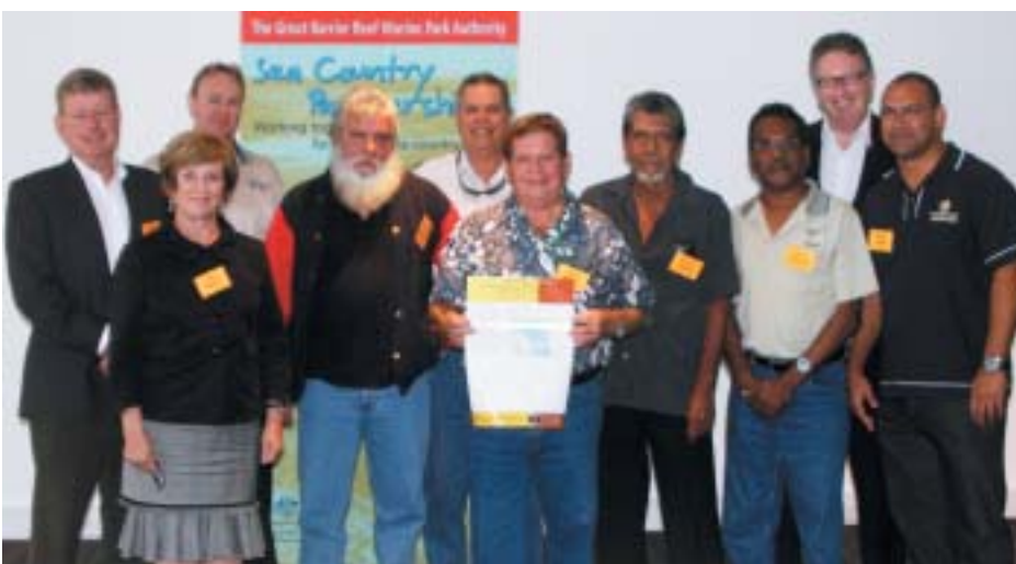
Accrediting the Mamu Traditional Use of Marine Resources Agreement