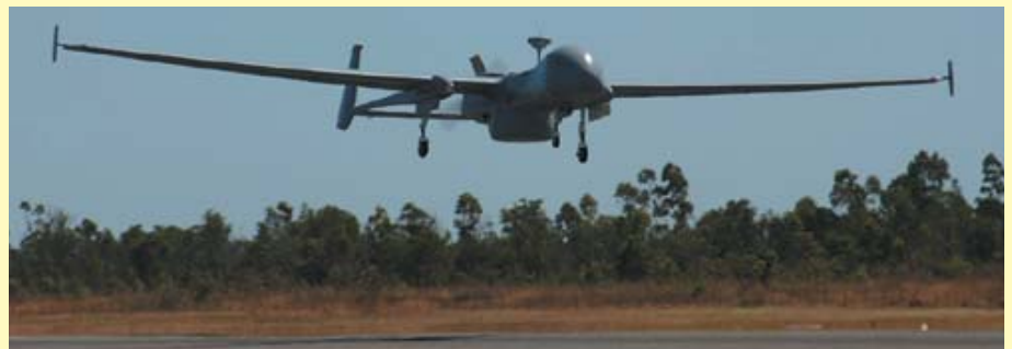
UAV lifts off from Weipa airfield

The Border Protection Command will prepare a report for government following the end of the trial.