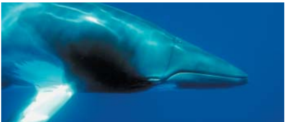
Whales in the Great Barrier Reef Marine Park