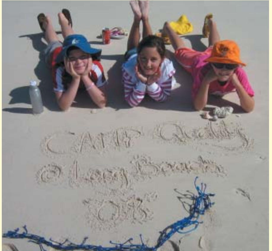
Spending time at the beach near Yeppoon