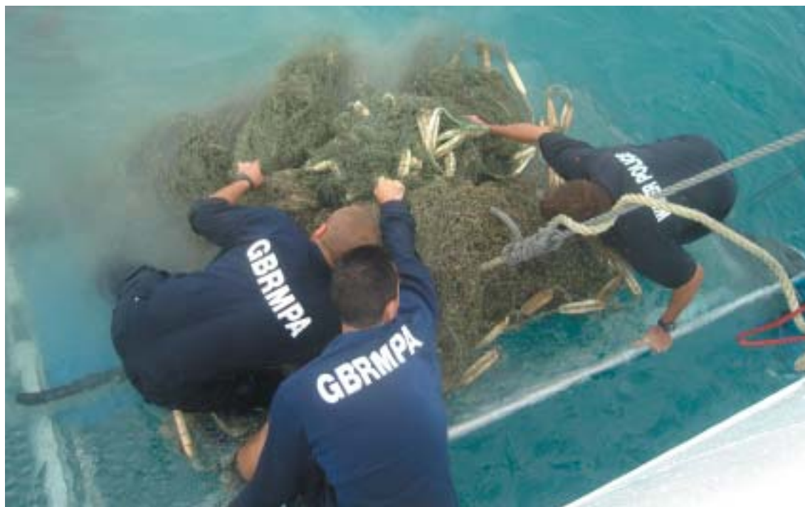
Retrieving the ghost net near Milman Island was no easy task – five field officers were involved over approximately nine hours

A two-tonne ghost net was hauled out of the water near Milman Island off Cape York recently, as part of a multi-agency retrieval operation.