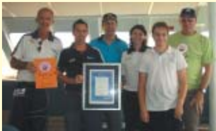
Townsville Camp Quality trip