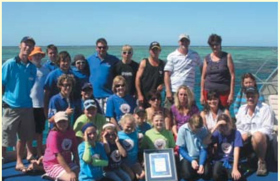
Cairns Camp Quality trip