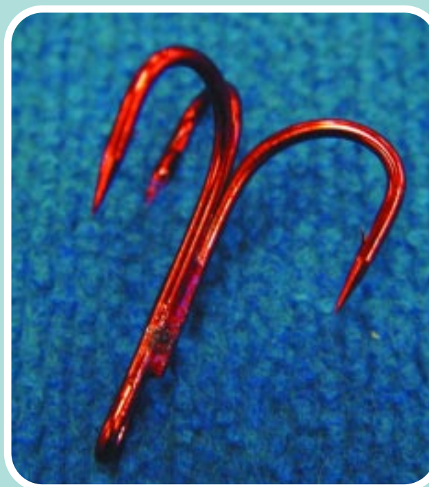
Single-shanked treble hook