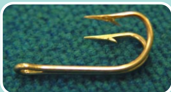
Single-shanked double hook