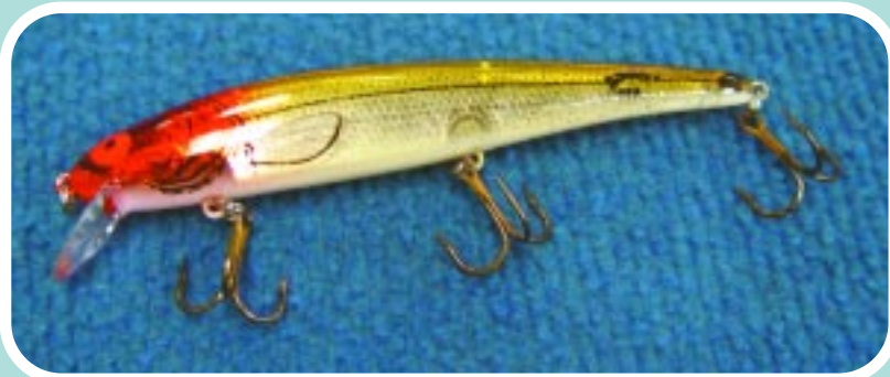
Lure (an artificial bait with no more than 3 hooks attached)