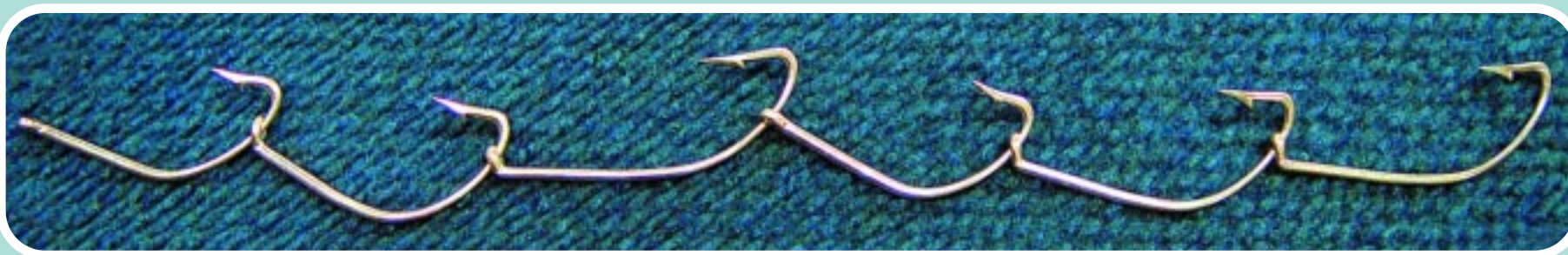
Ganged hook set comprising no more than 6 hooks (each of which is in contact with at least one other hook in the set)