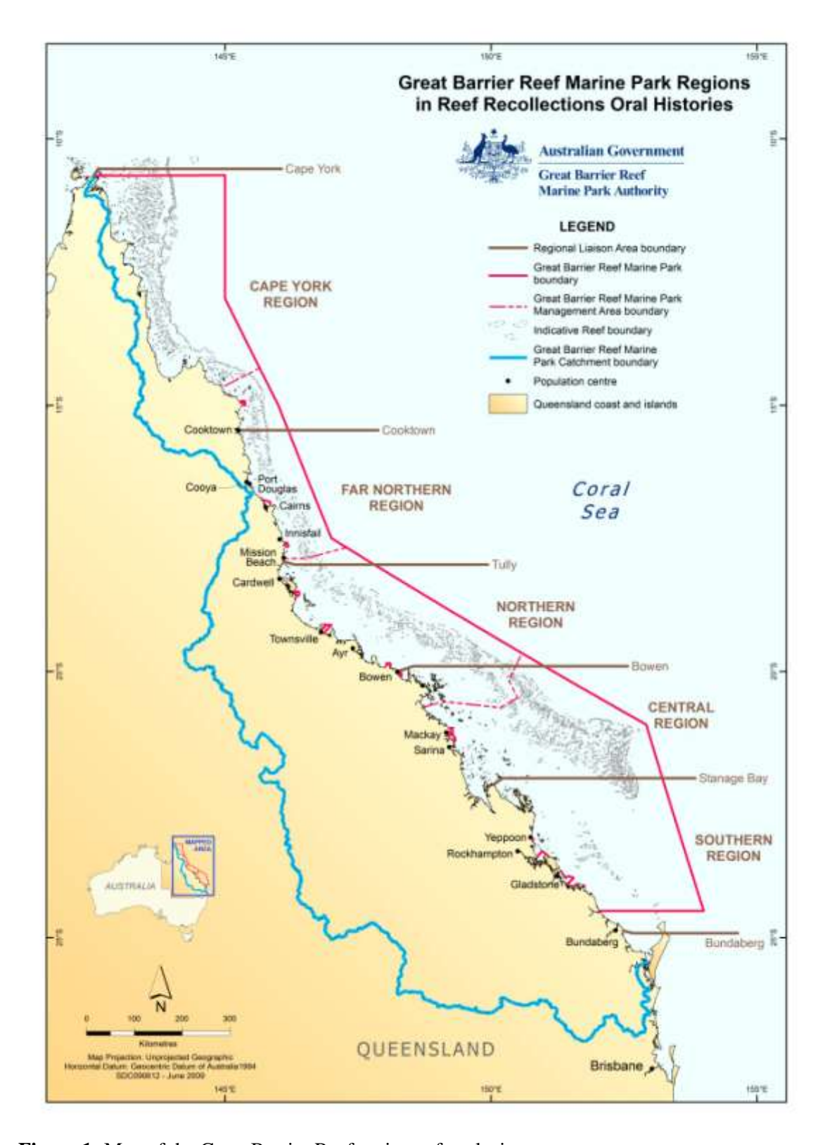
Figure 1: Map of the Great Barrier Reef regions of analysis