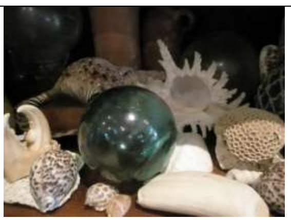
Shell collecting, Damien Langley's collection

In coral environments like the Great Barrier Reef, there are around 3000 species of molluscs and shells. They vary in size from the tiny "micromolluscs" and nudibranchs that are less than one millimetre long, to the giant clams that can be up to a metre long. They exist in all habitats in the Great Barrier Reef and for countless years, humans have collected molluscs for food, trade and decoration (Willan, 2008). Commercial shell collectors harvest from a broad range of molluscs. These are collected by commercial and recreational fishers for the purpose of display, collection, classification, research or