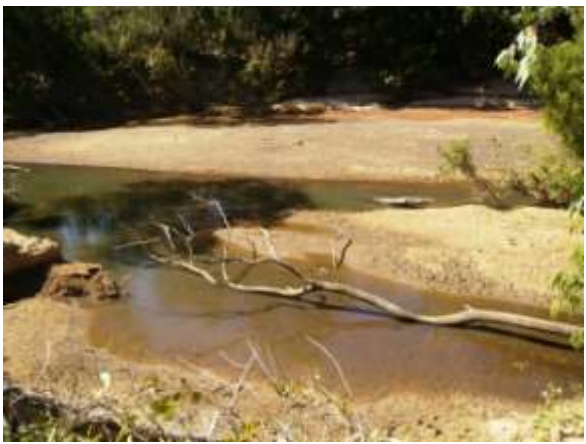
Lakefield National Park, near Cooktown, far north Queensland

A lot of people don't have the advantage of a healthy lifestyle. That's why the Aboriginal food system has just broken far n down so if we can keep that up, [it will] help the people as well.