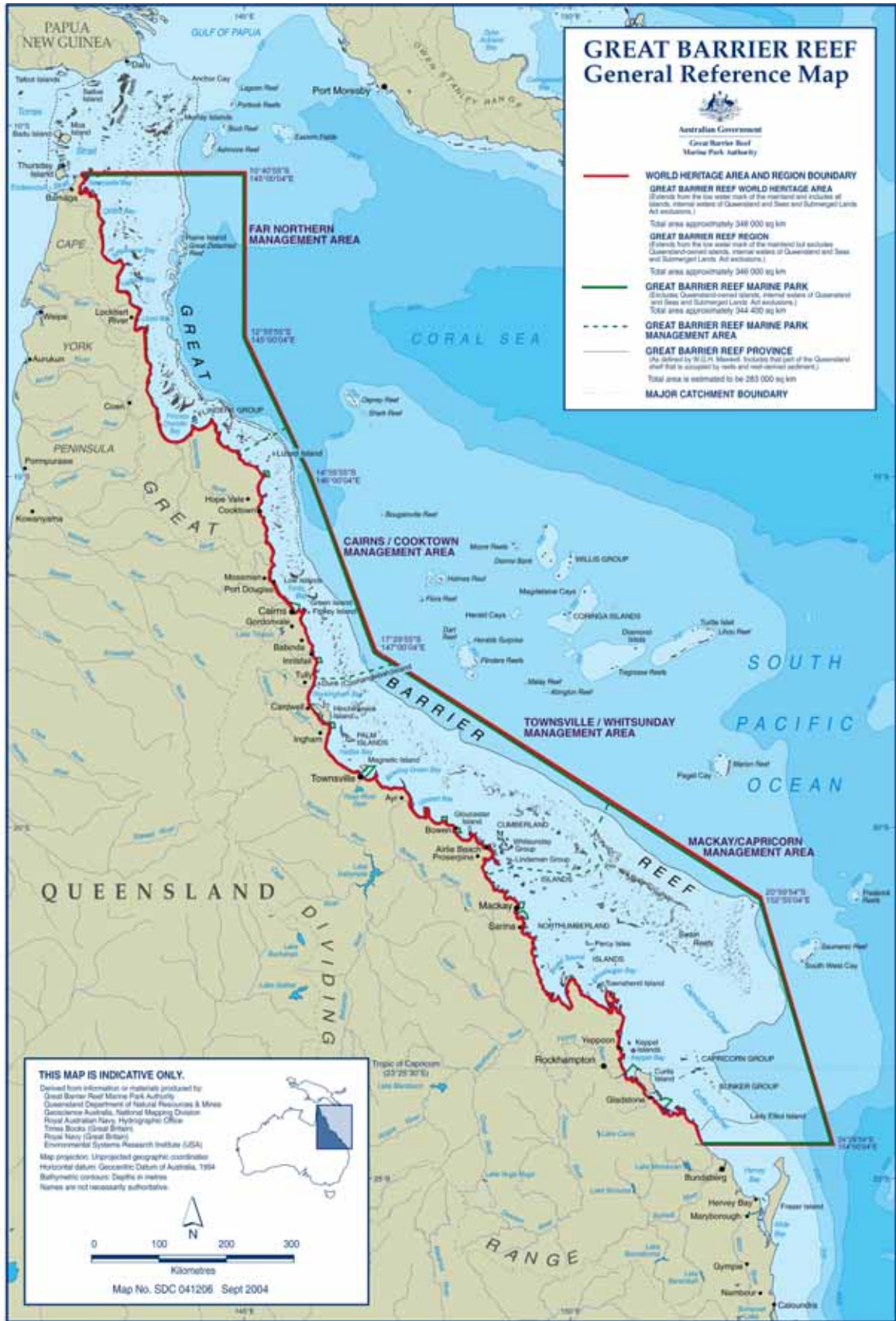
FIGURE 1. MAP OF THE GREAT BARRIER REEF MARINE PARK AND GREAT BARRIER REEF WORLD HERITAGE AREA BOUNDARIES