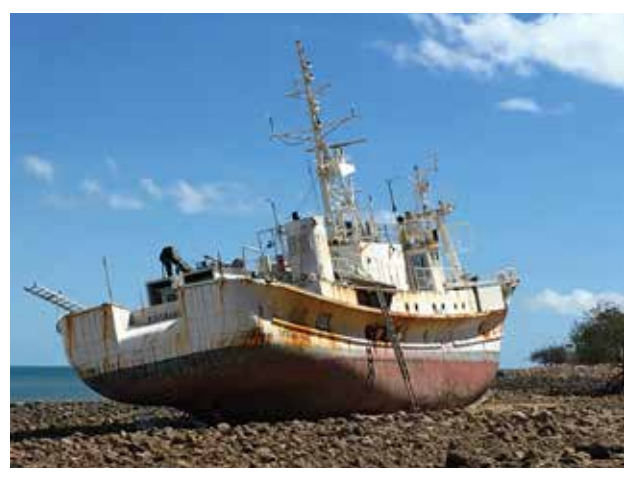
A vessel pushed up on the shore by cyclone Debbie in 2017.