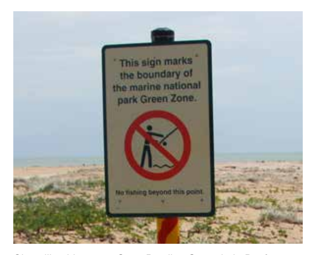
Signs like this one at Cape Bowling Green help Reef users avoid fishing illegally.

The overall risk to the Region from direct use remains medium (Figures 9.2 and 9.4). Among the many uses of the Region, ports and fishing have begun major reform processes during the last five years. Some positive achievements have occurred for ports in the early stages of implementation (Sections 5.7 and 7.3.4). Nevertheless, maintenance dredging and disposal can still be permitted and, with larger ships visiting the Region (Section 5.8), port related infrastructure and activities may need to evolve to accommodate larger ships. This may increase the risk of damage to the seafloor (for example, from increased ship anchoring and resuspension of sediments from ship propellers).