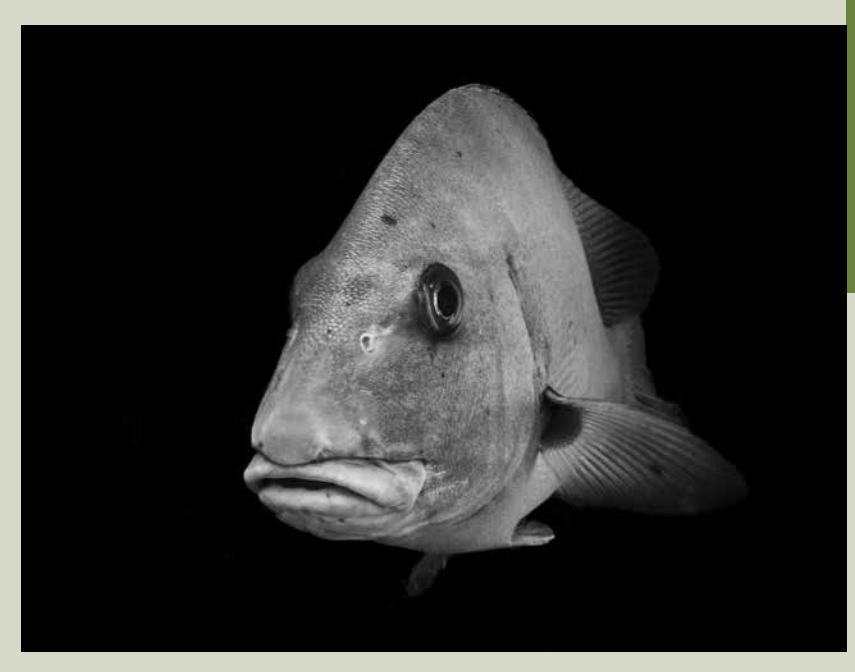
Painted sweetlips at Lizard Island.

There is a very real and present danger that the combination of threats present in the Region will continue to weaken the resilience of the Reef ecosystem. As a consequence, the Reef's ability to recover from serious and increasingly frequent environmental disturbances (such as mass coral bleaching events) remains at high risk. The need for a combination of Reef-wide, regional and local solutions is well recognised, as is the importance of continuing to improve methods for understanding and responding to cumulative impacts.