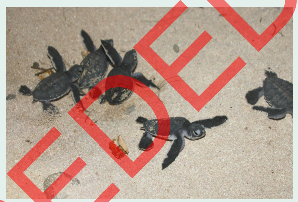
Turtle hatchlings, © Commonwealth of Australia (Great Barrier Reef Marine Park Authority), photographer: M. Turner

Climate change is causing the rapid feminisation of green turtles, as the sex of turtle hatchlings is determined by temperature. In a recent study, only about one per cent of juvenile turtles from warmer nesting beaches in the northern Great Barrier Reef hatched male, compared to 31-34 per cent from cooler southern nesting beaches, raising concerns about viability of future populations.<sup>24</sup>