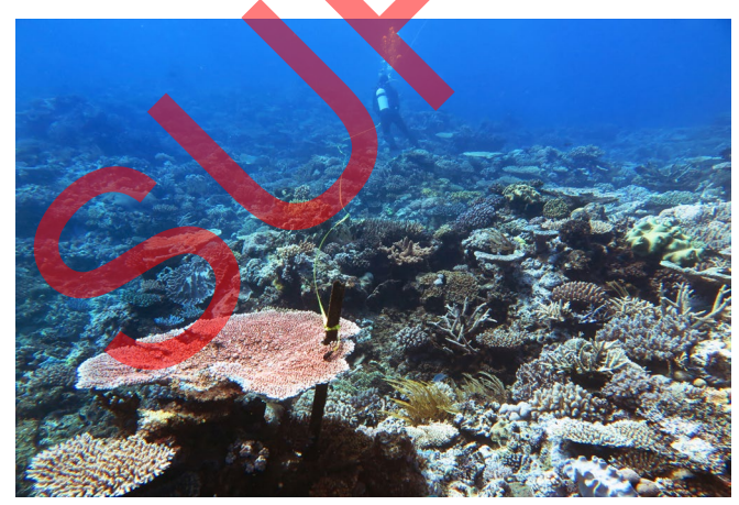
Thetford Reef near Cairns. 2016 before coral bleaching.

Increasing sea temperature is likely to increase the proportion of severe tropical cyclones and the frequency and severity of heavy rainfall events.<sup>12</sup>