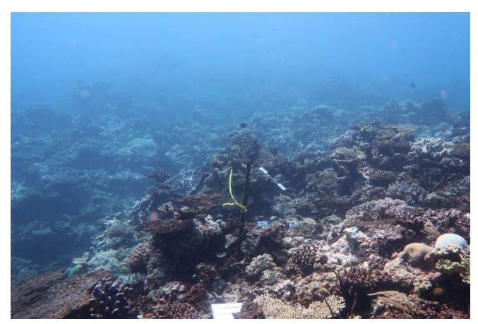
Thetford Reef near Cairns. 2017 after bleaching