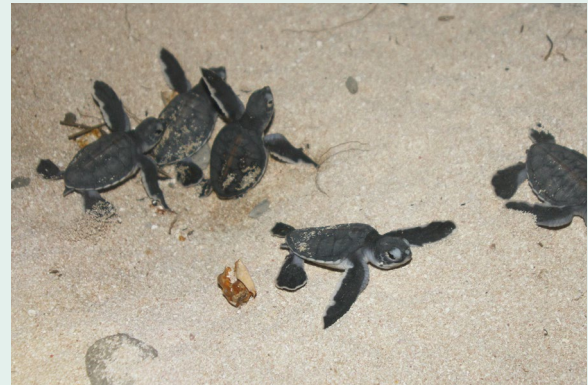
Turtle hatchlings

Climate change is causing the rapid feminisation of green turtles, as the sex of turtle hatchlings is determined by temperature. In a recent study, only about one per cent of juvenile turtles from warmer nesting beaches in the northern Great Barrier Reef hatched male, compared to 31-34 per cent from cooler southern nesting beaches, raising concerns about viability of future populations. 24