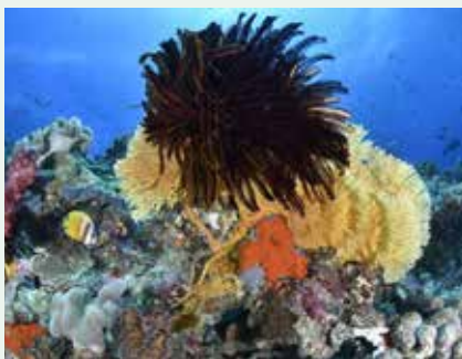
Great Barrier Reef underwater

Further detail on the Authority's definition and approach to Indigenous heritage values can be found in the Traditional Owner Heritage Assessment Guidelines . 12