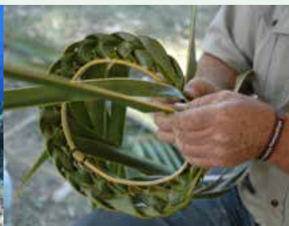
Traditional hat weaving at Port Curtis Coral Coast