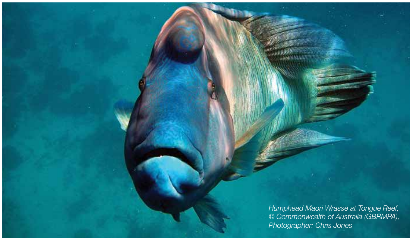
Humphead Maori Wrasse at Tongue Reef

There is currently no peak body for Aboriginal and Torres Strait Islander peoples in the Reef to collectively discuss issues, implement actions and represent Traditional Owners' interests in high level forums. This makes it difficult for Traditional Owner groups to collaboratively address heritage management issues at a Reef scale.