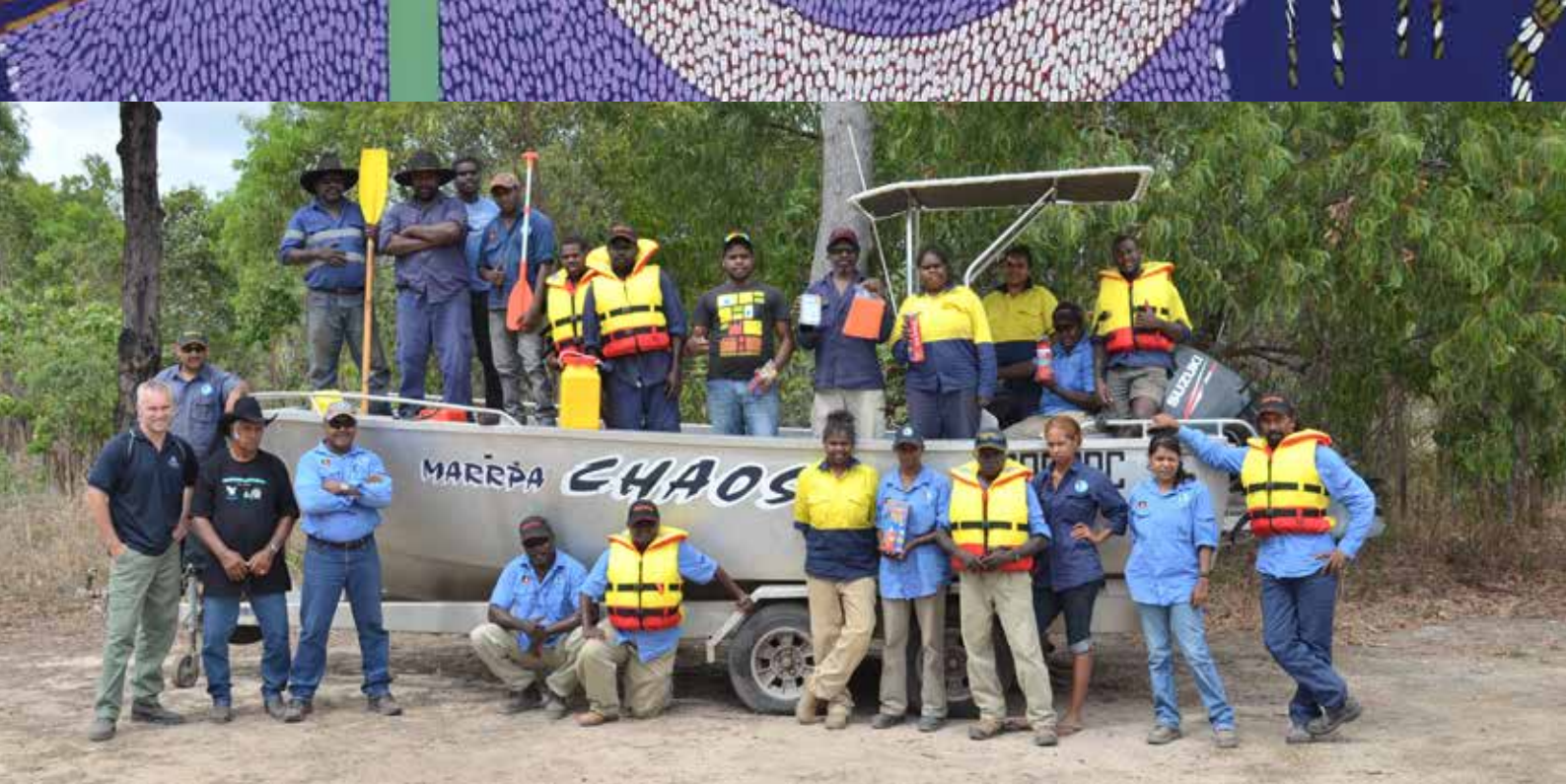
Lama Lama rangers undertaking boat safety training, © Commonwealth of Australia (GBRMPA)