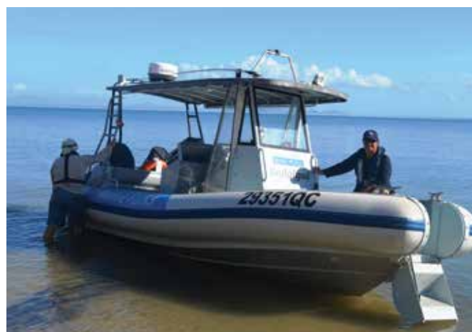
Indigenous compliance officers

To continue to deliver cultural responsibilities for sea country and lore, Aboriginal and Torres Strait Islander peoples have formed organisations to manage land and sea programs through administration, project officers and rangers. Many are Traditional Owner organisations, following cultural protocols and exercising cultural authority on behalf of specific Traditional Owner groups. These organisations can have partnerships with other organisations that also contribute to heritage management. Some have developed on-ground management capacity through ranger programs, such as through the Australian Government’s Working on Country Program and the Queensland Government’s Land and Sea Rangers Program.