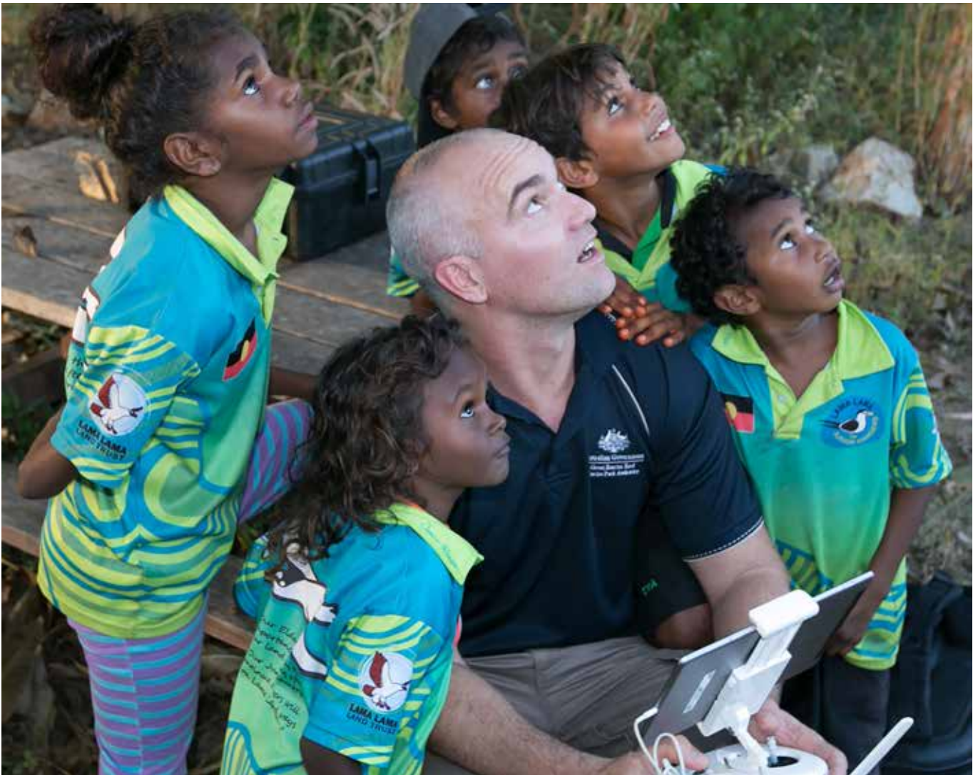
Lama Lama junior rangers learn about drones

engagement processes. 7 The Authority engaged other Reef management partners, including the Queensland Government Department of Aboriginal and Torres Strait Islander Partnerships, the Queensland Land and Sea Ranger Program, the Department of the Prime Minister and Cabinet and the Australian Government Department of the Environment and Energy.