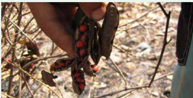
Traditional gathering of berries