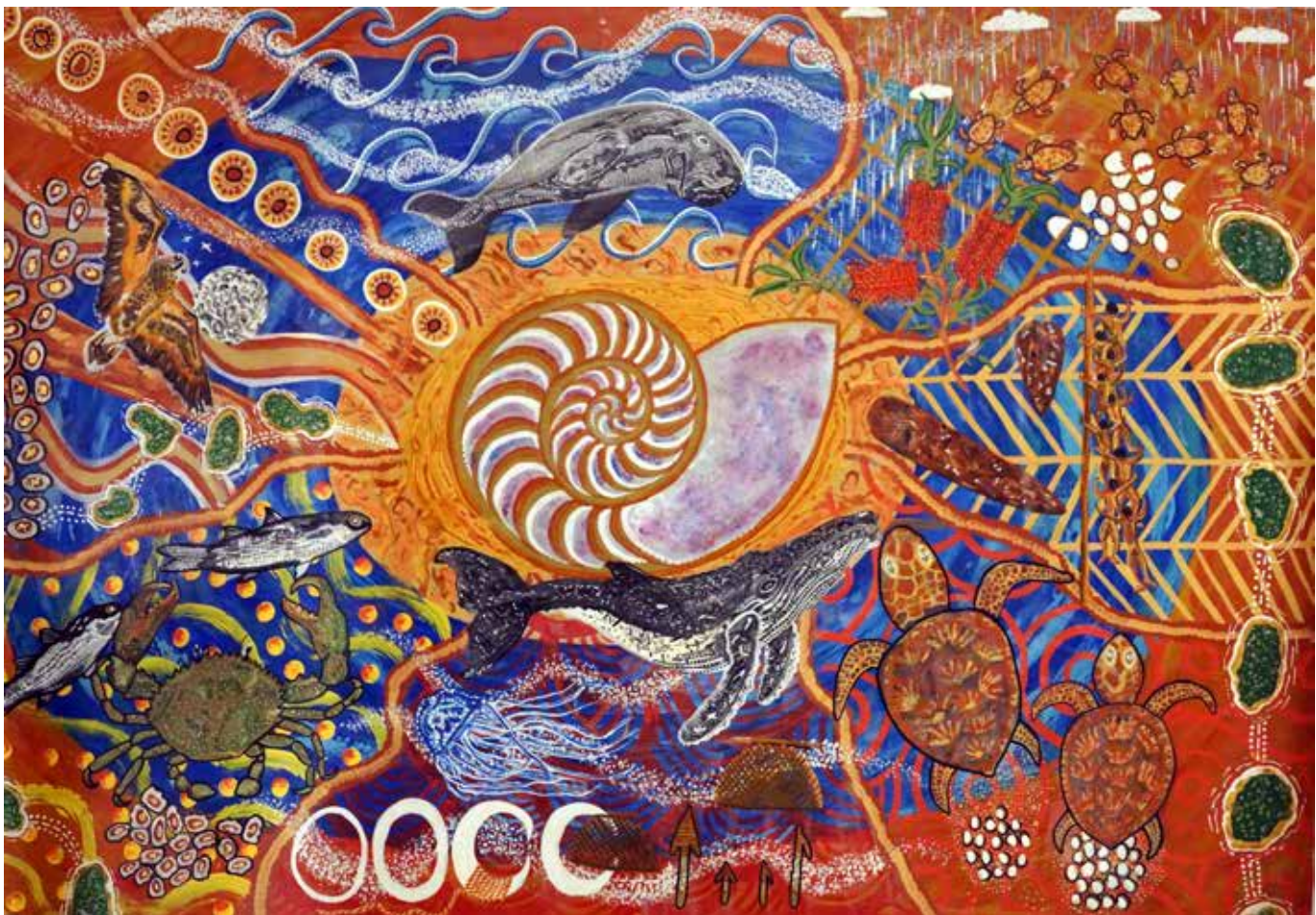
Woppaburra seasonal calendar, © Woppaburra Traditional Owners

Six workshops were held with Traditional Owner organisations – both with and without formal agreements with the Authority – from all geographic regions, covering over 20 Traditional Owner groups and more than 80 participants. The Queensland Land and Sea Rangers Forum 2017 provided input. Contribution was also made from previous