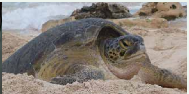
Turtles nesting at Raine Island, © Commonwealth of Australia (GBRMPA)