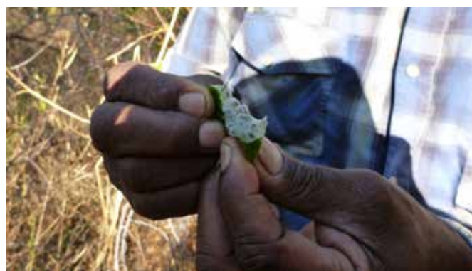
Bush food, © Commonwealth of Australia