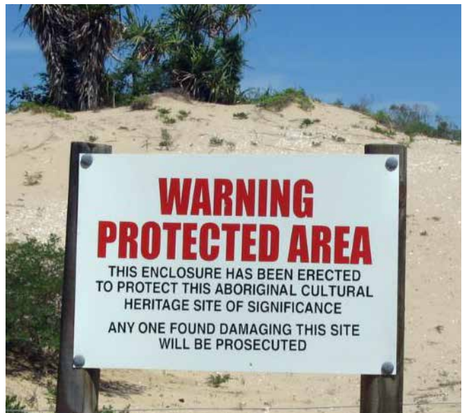
Protected area signage at Wunjunga Beach for cultural heritage site

The Authority is committed to Traditional Owners having increasing input into Authority decision making. For this to occur it is essential that the Authority has the culturally-correct contacts and decision makers for each area and issue. The Authority is committed to developing a consultation process and protocol to ensure Traditional Owners have input into decisions and policies.