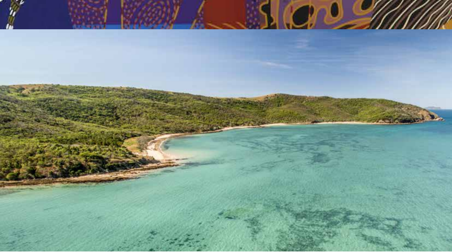
Woppaburra sea country, © Commonwealth of Australia (GBRMPA)

the remaining heritage values of the Reef, managing sea country, recording oral tradition and expressing living culture. Aboriginal and Torres Strait Islander peoples are increasingly re-asserting their role in managing their country through active engagement in on-country management and policy and planning programs. 16