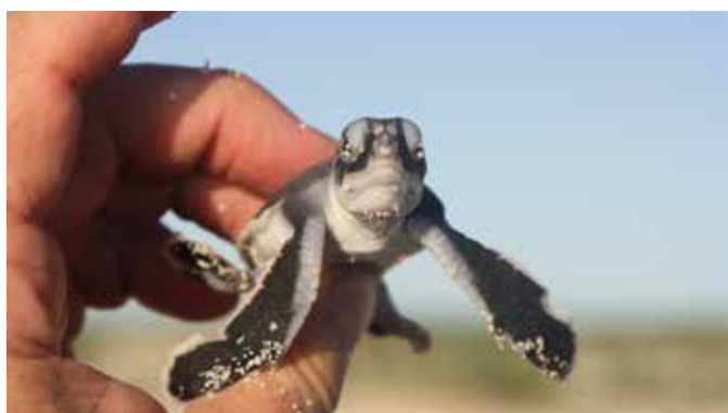
Turtle hatchlings on Raine Island