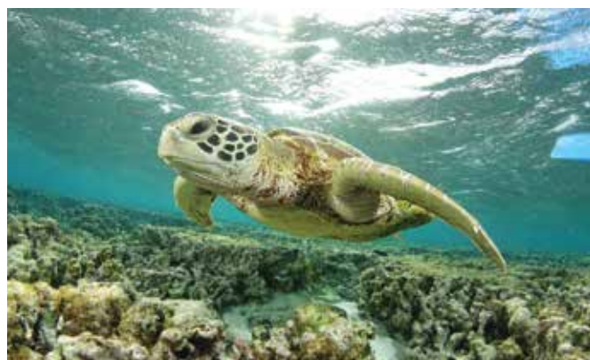
A sea turtle in the Marine Park, © Commonwealth of Australia (GBRMPA)

The Great Barrier Reef Marine Park Act 1975 (the Marine Park Act) aims to provide for the long-term protection and conservation of the environment, biodiversity and heritage values of the Great Barrier