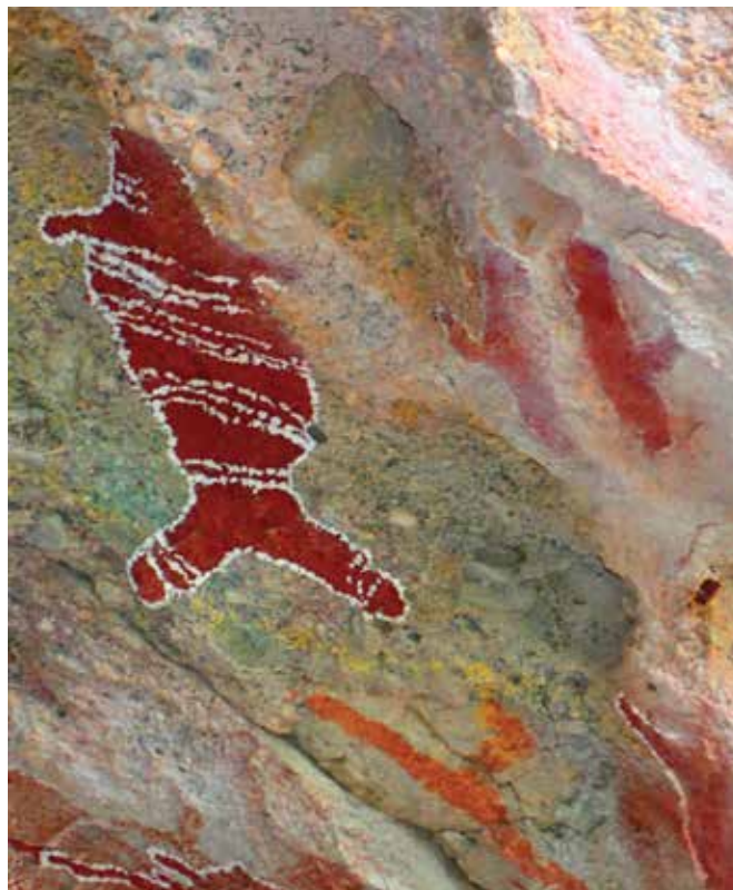
Depiction of dugong and turtle in rock art site on an offshore island in Cape York, © Commonwealth of Australia (GBRMMPA)

The Authority recognises Aboriginal and Torres Strait Islander peoples have connection to areas of the Reef that extend beyond the official Marine Park boundary, including into Torres Strait waters. The eastern reefs of the Torres Strait form the intact northern extension of the Great Barrier Reef, and are increasingly recognised for their potential refugia