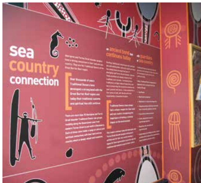
Showcasing sea country connection in the Reef HQ Aquarium

The Authority is committed to respecting Aboriginal and Torres Strait Islander peoples in all of its business, and continuously improving the cultural competence, respect and understanding of its staff. In 2018 the Authority launched its Reflect