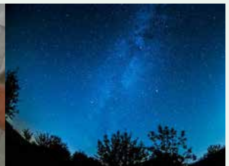
Traditional astronomy is used for navigation, calendars, and to predict weather