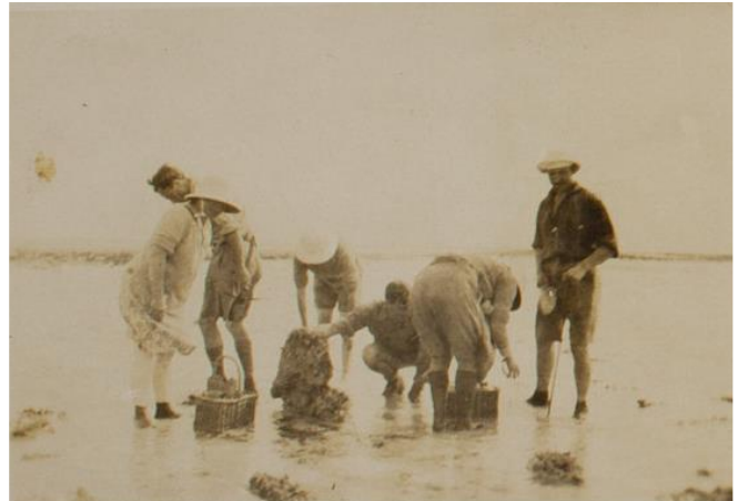
Photograph from the Great Barrier Reef Expedition 1928-29, captioned 'Batt Reef, 2 August 1928'.