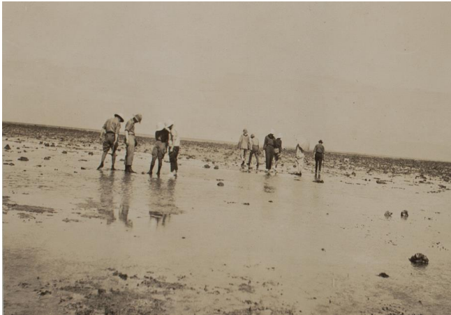
Photograph from the Great Barrier Reef Expedition 1928-29, captioned 'First day in reef Low Isles, 7 July 1928'.